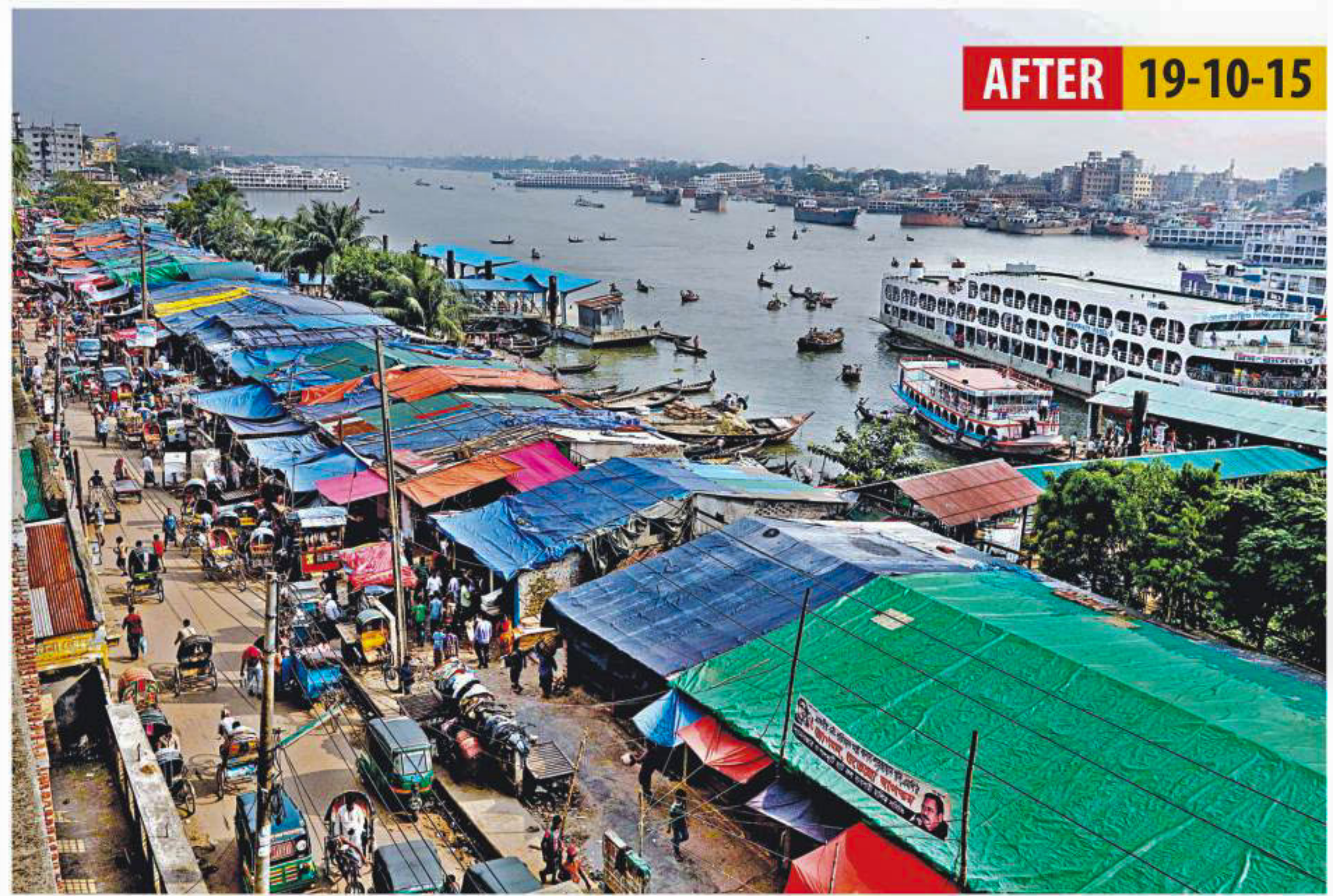
Illegal structures on the banks of the Buriganga in the city's Shyambazar were partially demolished by Bangladesh Inland Water Transport Authority over four months ago. But making a mockery of the BIWTA's eviction drive, traders are again setting up shops there, thanks to lax monitoring and law enforcement.