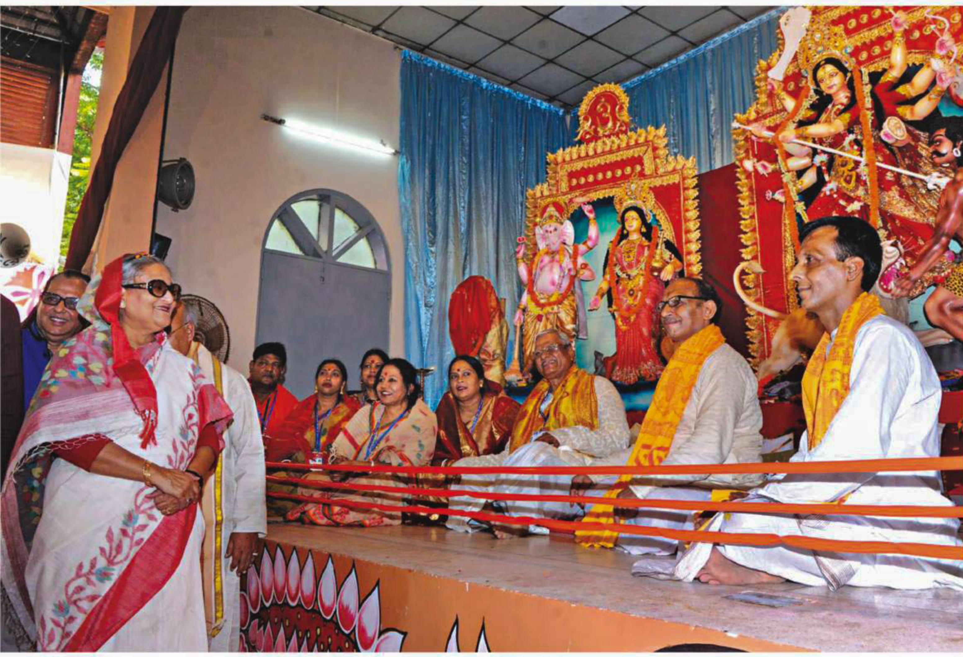
Prime Minister Sheikh Hasina visiting Dhakeshwari National Temple in the capital on the occasion of Maha Saptami of Durga Puja celebration yesterday.