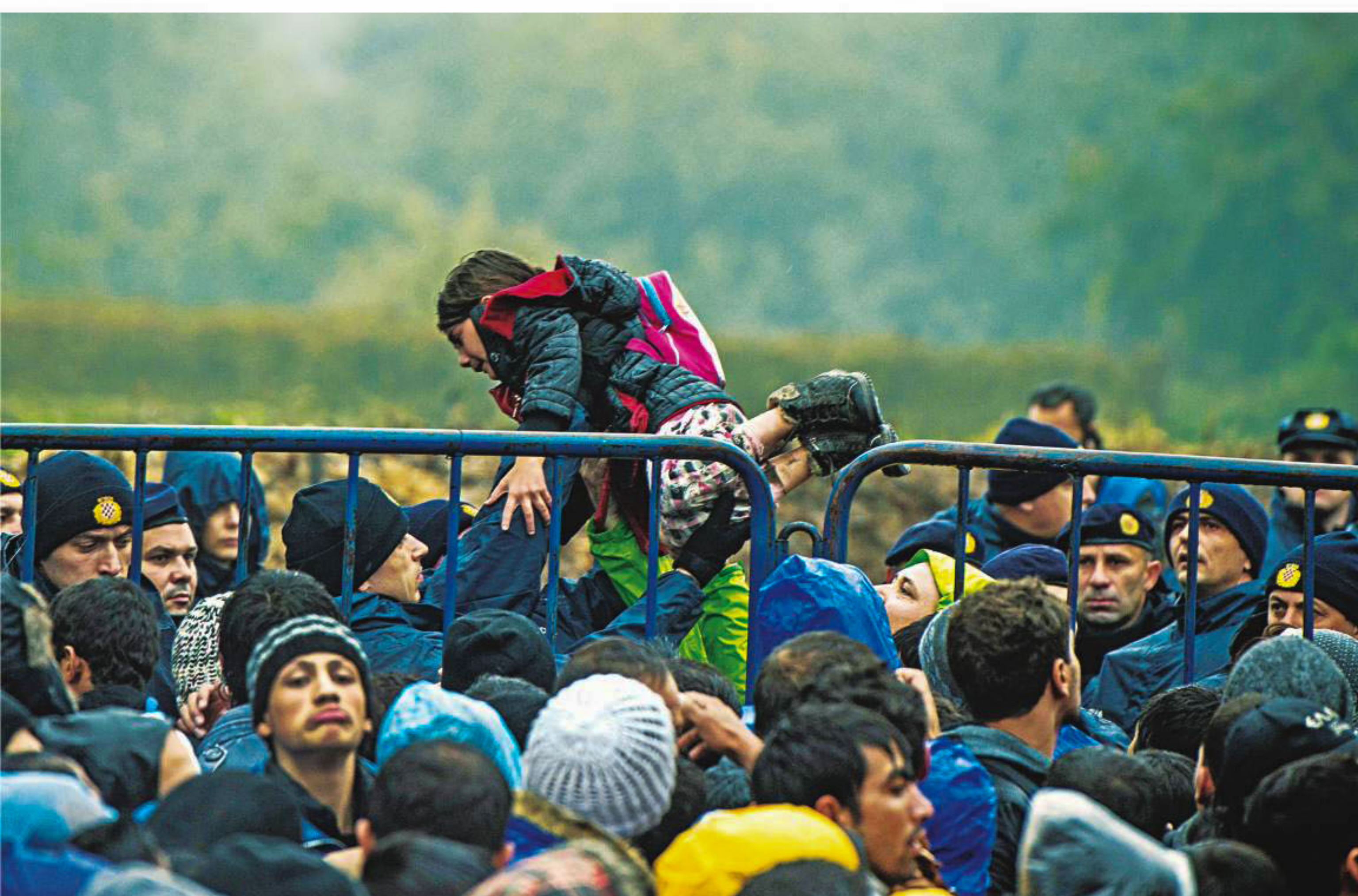
A Croatian police officer carries a child as migrants wait to enter Croatia from the Serbia-Croatia border, near the western Serbian village of Berkasovo, yesterday. Several hundred people got stuck on the border yesterday morning after having spent the night in rain and cold.