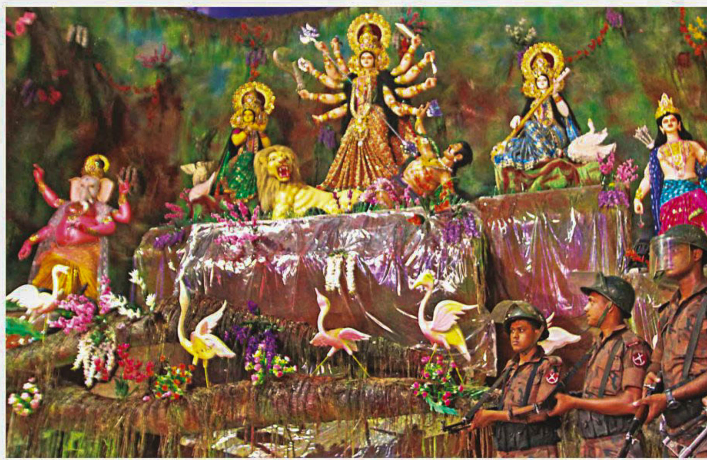
Members of Border Guard Bangladesh stand guard at a puja mandap in Chittagong's Anderkilla yesterday. Security has been beefed up in and around makeshift temples across the country ahead of Durga Puja, the biggest religious festival of the Hindus, beginning with the Mahashashthi today.