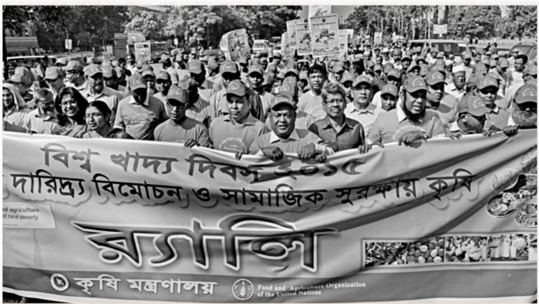
The Ministry of Agriculture brings out a procession on the capital's Manik Mia Avenue on the occasion of World Food Day yesterday.