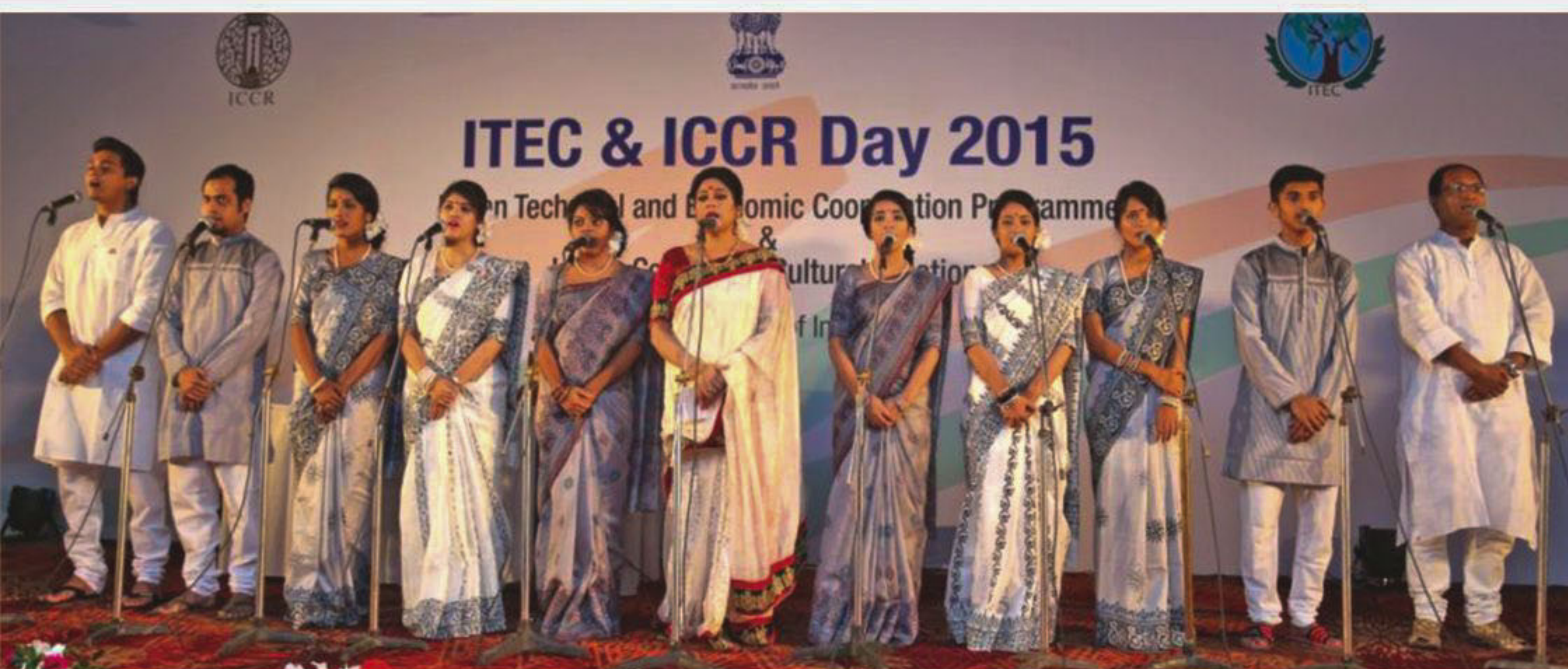
The High Commission of India celebrated the Indian Technical and Economic Cooperation (ITEC) and Indian Council for Cultural Relations (ICCR) Day on October 14 at the Bangabandhu International Conference Centre, Dhaka. Tofail Ahmed, Minister of Commerce, Government of Bangladesh graced the occasion as chief guest. High Commissioner of India Pankaj Saran was also present. ITEC and ICCR alumni along with members of the Youth Delegations that have visited India attended the programme. A Colourful cultural programme followed.