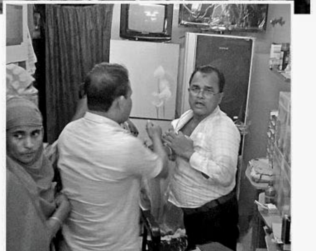
Inset, relatives of the woman assaulting the offender inside the shop.

Villagers and relatives of a young woman besiege the shop of a local Swechchhasebak League leader at Natunbazar in Parbatipur upazila of Dinajpur Wednesday evening as he gave 'illicit' proposal to the woman who demanded return of the money the leader had earlier taken from her family with a promise of giving her job of a police constable.