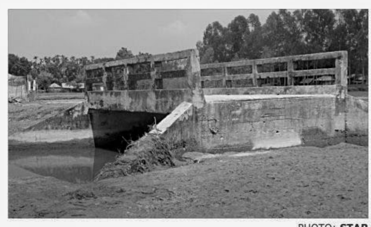
This bridge at Barabari village in Patgram upazila of Lalmonirhat district remains useless as its approach road was damaged by recent flood.

damaged by flood," said Abdul Jalil, 55, of Barabari village of Dahagram-Angarpota. The bridge was used for movement of rickshaws, vans, bicycles and trolleys on the road and it helped farmers to transport their produced crops easily but they are in trouble now due to damage of the approach road, said Delowar Hossain, 55, of Dakkhin Charvillage. "Our school going children have become the worst sufferers due to the situation. We appealed to the local union parishad authority for repairing the approach road of the bridge, but to no result yet," said Abdul Gani, 62, of the same village. Habibur Rahman, chairman of Dahagram union parishad, said, "I have appealed to the upazila administration for fund to repair the damaged approach road. I will start the work immediately after getting fund for the purpose."