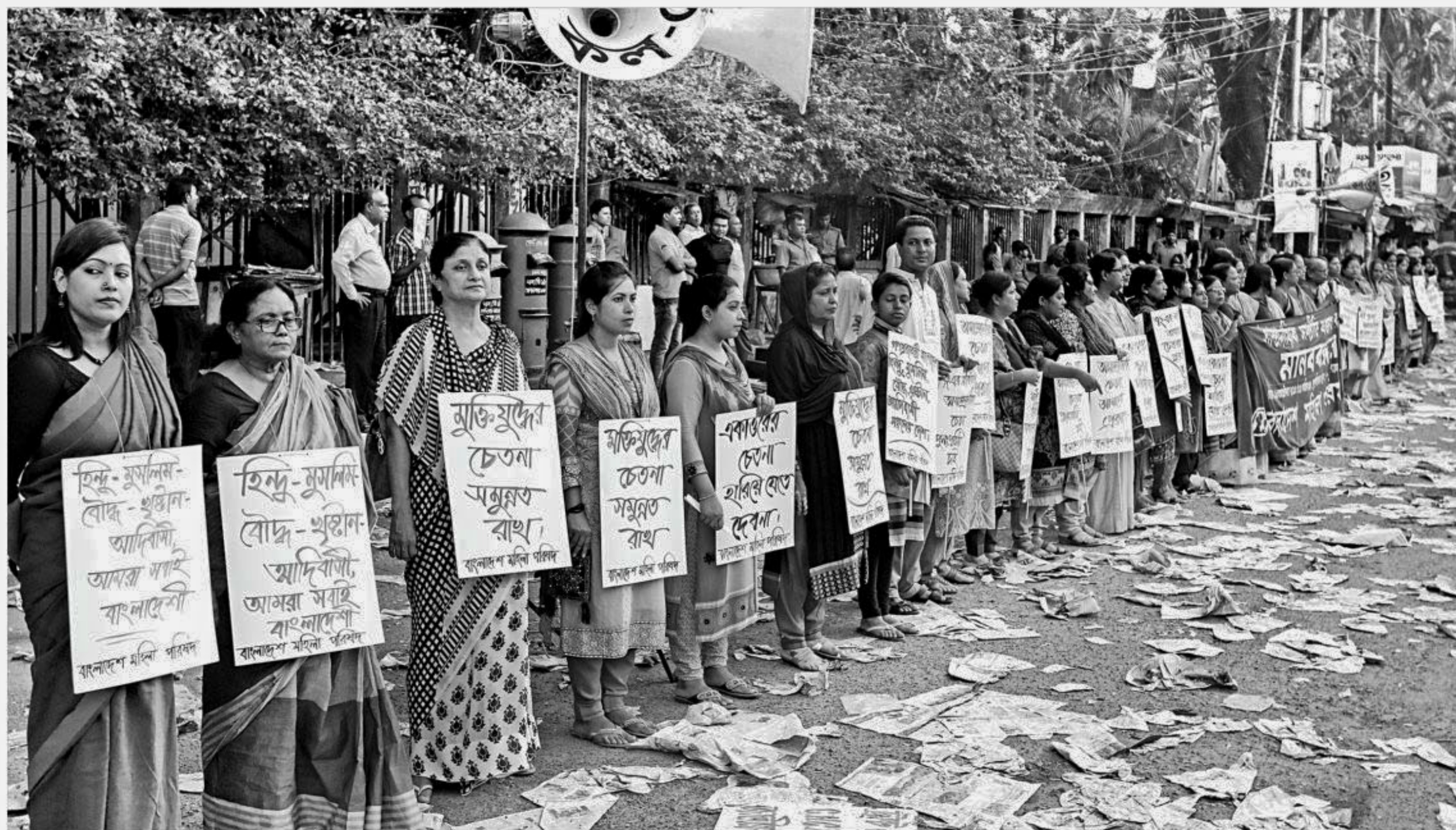
Bangladesh Mahila Parishad forms a human chain in front of the capital's Jatiya Press Club yesterday, calling for sustenance of communal harmony among the people of different faiths and ethnicities in Bangladesh.

Paltan police pressed the charges on August 19, 2014. It says around 300 leaders and activists of the alliance brought out a procession from Fakirapool area towards BNP's Nayapaltan central office and threw bombs at police, leaving several injured, and vandalised vehicles.