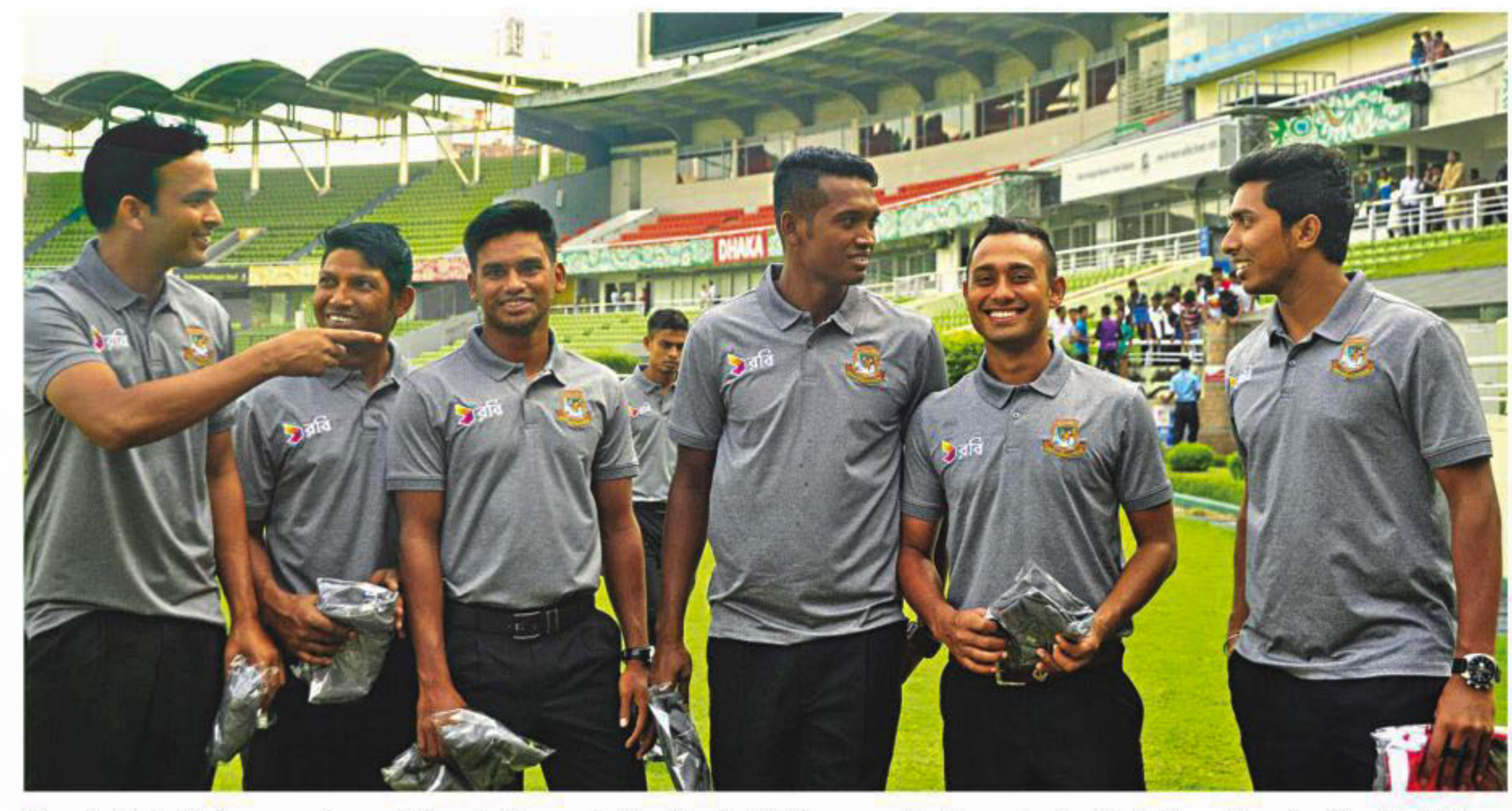
Bangladesh A players share a joke during a photo-shoot at Mirpur yesterday prior to their departure for South Africa, where they are scheduled to play a three-day game and three one-dayers against their counterparts. After that, they will travel to Zimbabwe and face the hosts in three one-dayers and two four-day matches.

Malik was drafted into the XI for the Abu Dhabi opener. And in his first Test match since August 2010 - and 33rd overall since his debut in 2001 - he produced a career-best 245 from the No 3 spot. Asad Shafiq, who scored 107 for his ninth hundred, added 248 runs with Malik -- a new record in Pakistan-England Tests. England batsmen will have to bat out of their skins to thwart Pakistan's pace-cum-spin attack on a pitch which did not help the bowlers on the first two days but can change its nature as the game progresses. SCORES IN BRIEF PAKISTAN: First innings 523 for 8 decl (Hafeez 98, Malik 245, Younis 38, Shafiq 107; Anderson 2-42, Stokes 4-57) ENGLAND: First innings 56 for no loss (Cook 39 not out, Moeen 15 not out)