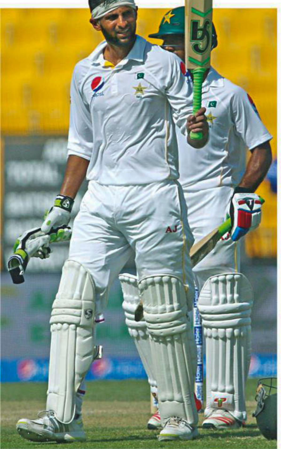
Shoaib Malik arose like a phoenix from its ashes yesterday, when he turned his 100 into a maiden double-hundred on the second day of the first Test against England in Abu Dhabi.