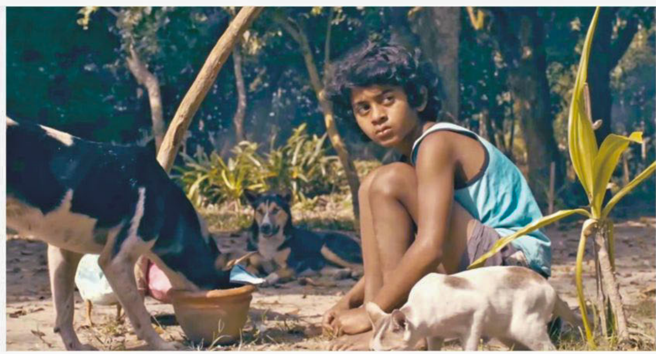
A scene from the film.