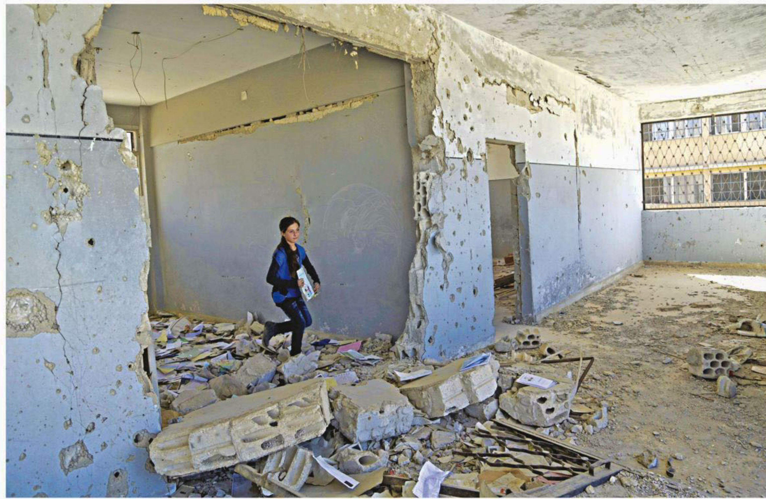
A student walks on the rubble at her damaged school, which was used before as a military camp for forces loyal to Syria's President Bashar al-Assad, in the rebel-controlled town of Ain Qurei in the southern countryside of Idlib, Syria on Monday.