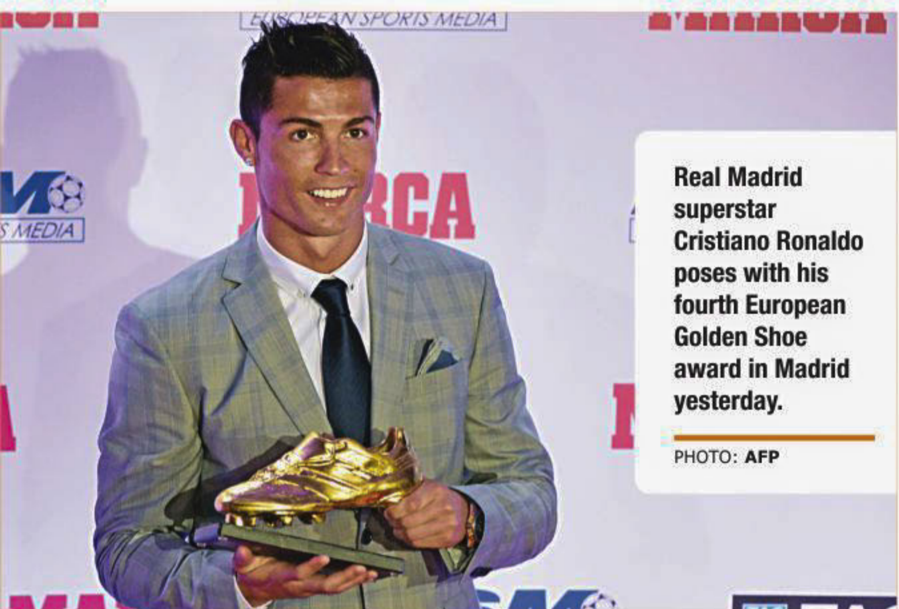
Real Madrid superstar Cristiano Ronaldo poses with his fourth European Golden Shoe award in Madrid yesterday.