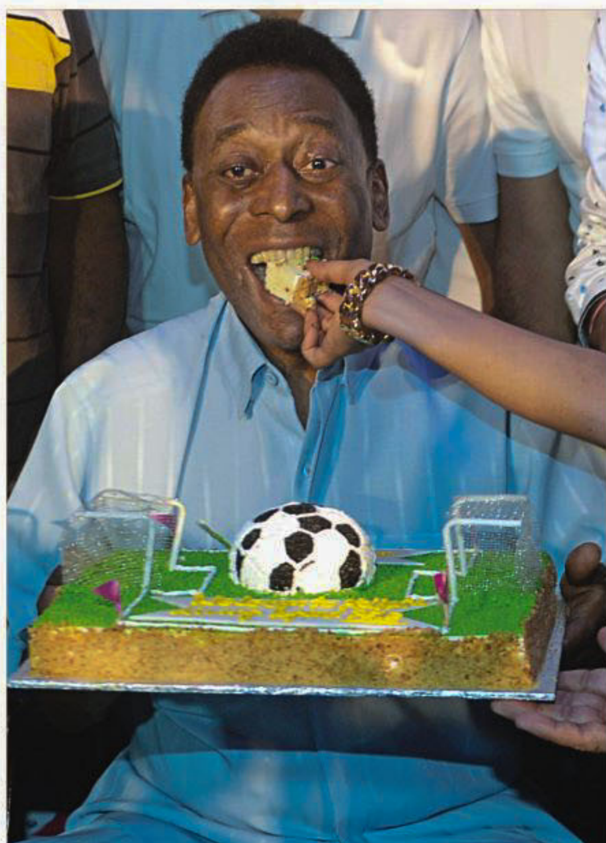
Brazil legend Pele eats a piece of cake presented to him to mark his upcoming 75th birthday (on October 23) at a function in Kolkata yesterday. Pele is on a three-day visit to the city.

Spain were the last team to achieve a 100 per cent qualification record in the Euros en route to winning the 2012 tournament. But, despite being unbeaten in 15 matches, the low standard of their Group E opposition means Hodgson's team are still something of an unknown quantity and have plenty to prove before they can dream of emulating Spain's achievement.