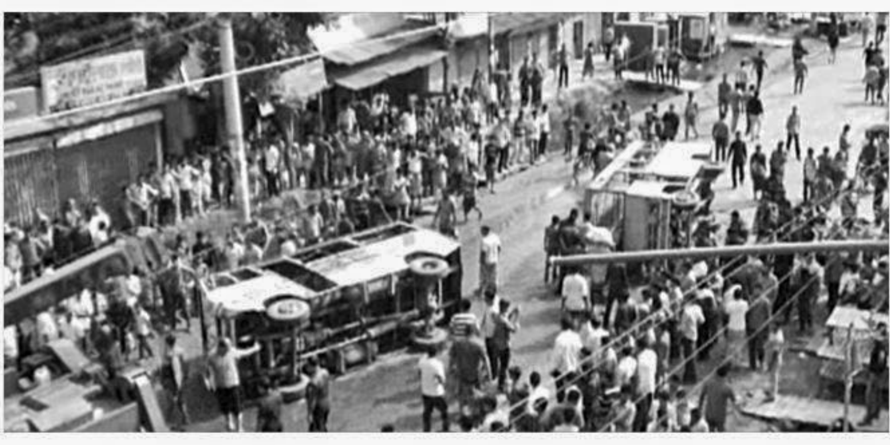
RMG workers set fire to three minibuses and vandalised five other vehicles on the Dhaka-Tangail highway after two female workers were killed in separate accidents on the highway yesterday.

Before a court on October 7, another arrested "JMB man" Babu confessed to the killing of a pir and his attendant on September 4.