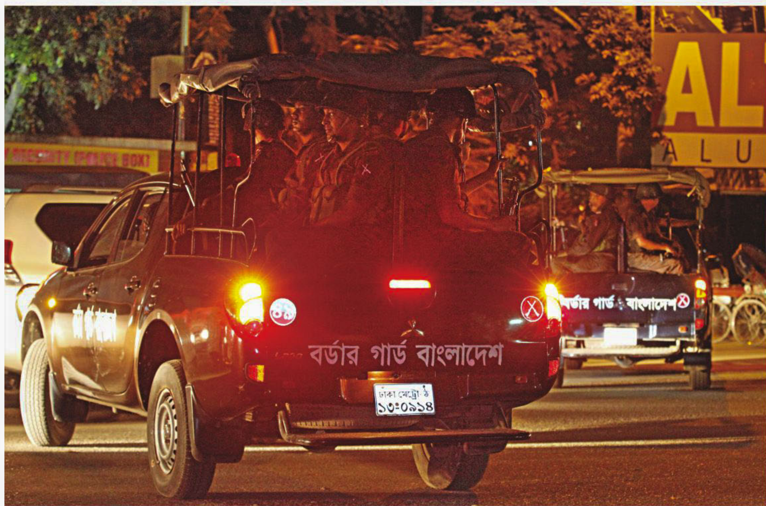
Border Guard Bangladesh (BGB) personnel patrol a street west of the US embassy in Baridhara yesterday as part of the beefed up security measures for the diplomatic zone in Dhaka following the recent killings of two foreigners.