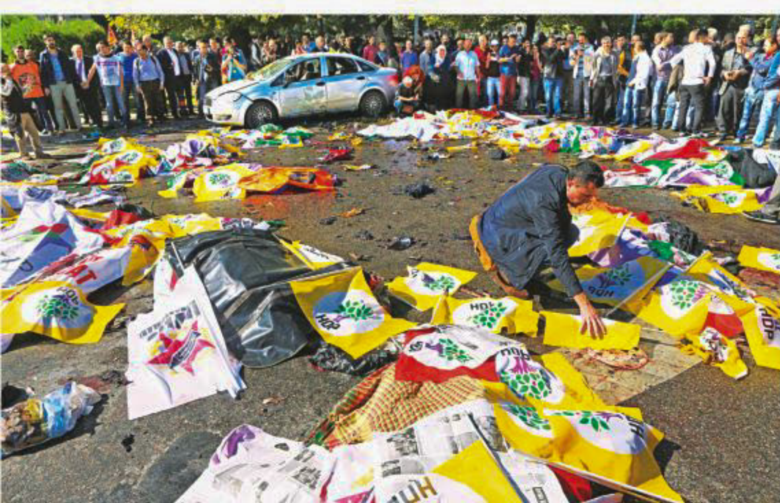
A video grab, below, shows a blast goes off during a peace rally in Ankara of Turkey yesterday. Above, bodies are covered with rally banners and flags, and an injured man hugs an injured woman after the explosion.