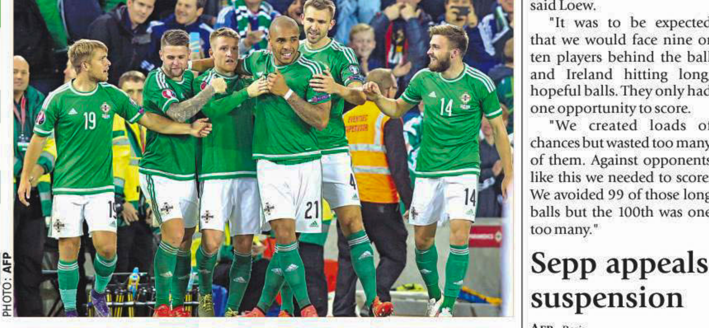
Northern Ireland players celebrate a goal during their historic victory against Greece, which put them into the Euro 2016 finals, in Belfast on Thursday.