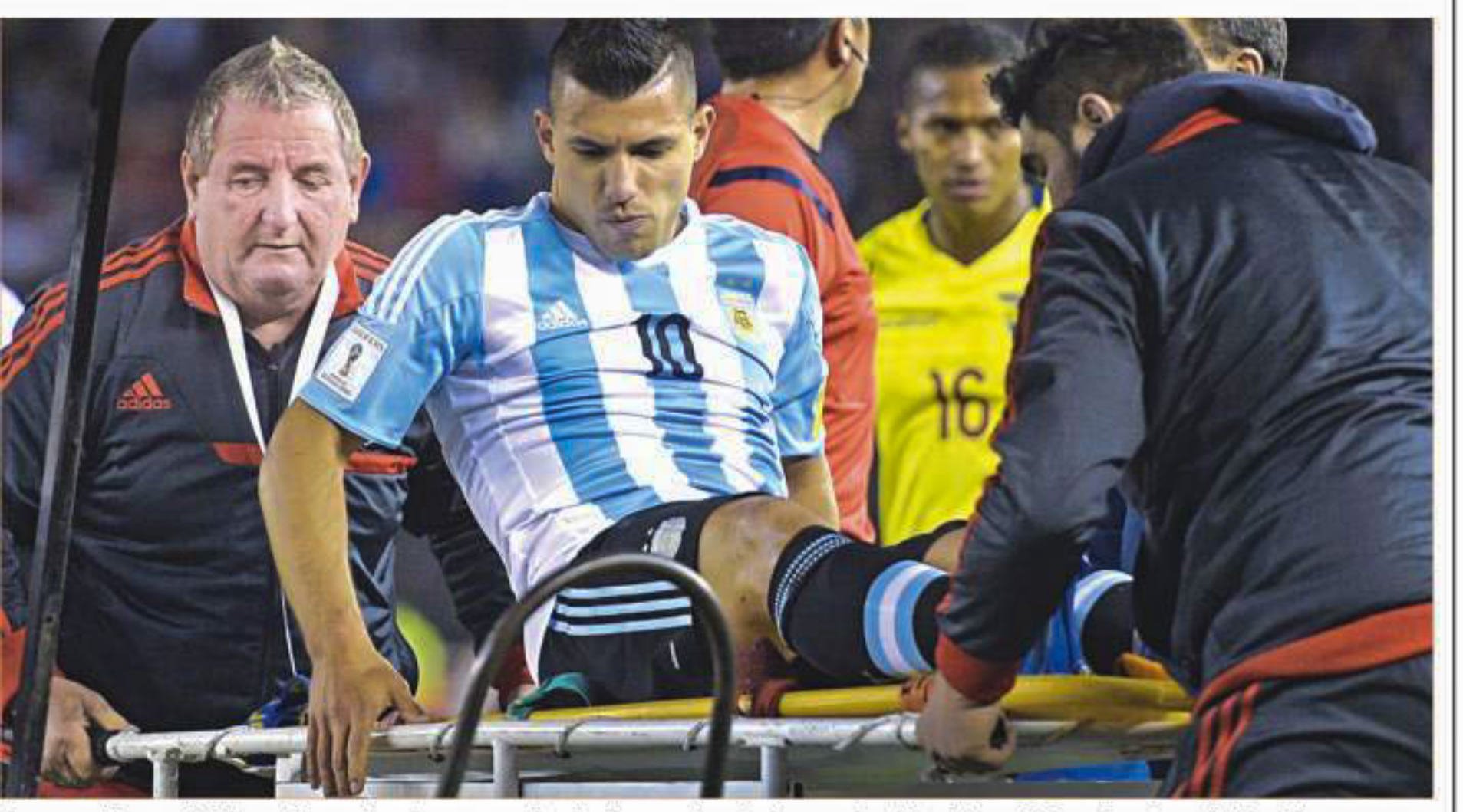
Argentina striker Sergio Aguero is being stretchered off after 22 minutes into the game against Ecuador in Buenos Aires on Thursday.

Romero for 2-0. The defeat piles the pressure on Argentina coach Gerardo Martino, whose position was already the subject of scrutiny following his team's failure to win the Copa America earlier this year. Brazil meanwhile -- also missing their talismanic presence with captain Neymar serving a suspension -- were undone by goals from Chile stars Eduardo Vargas and Alexis Sanchez in Santiago. Vargas, topscorer in Chile's triumphant Copa America campaign, picked up where he left off in that tournament to fire the hosts into the lead on 72 minutes. Arsenal star Sanchez then applied the coup de grace in the 90th minute, jabbing home from close range after a wonderful flowing move which ripped Brazil's defence apart. Chile manager Jorge Sampaoli hailed his side's victory, the first by Chile over Brazil