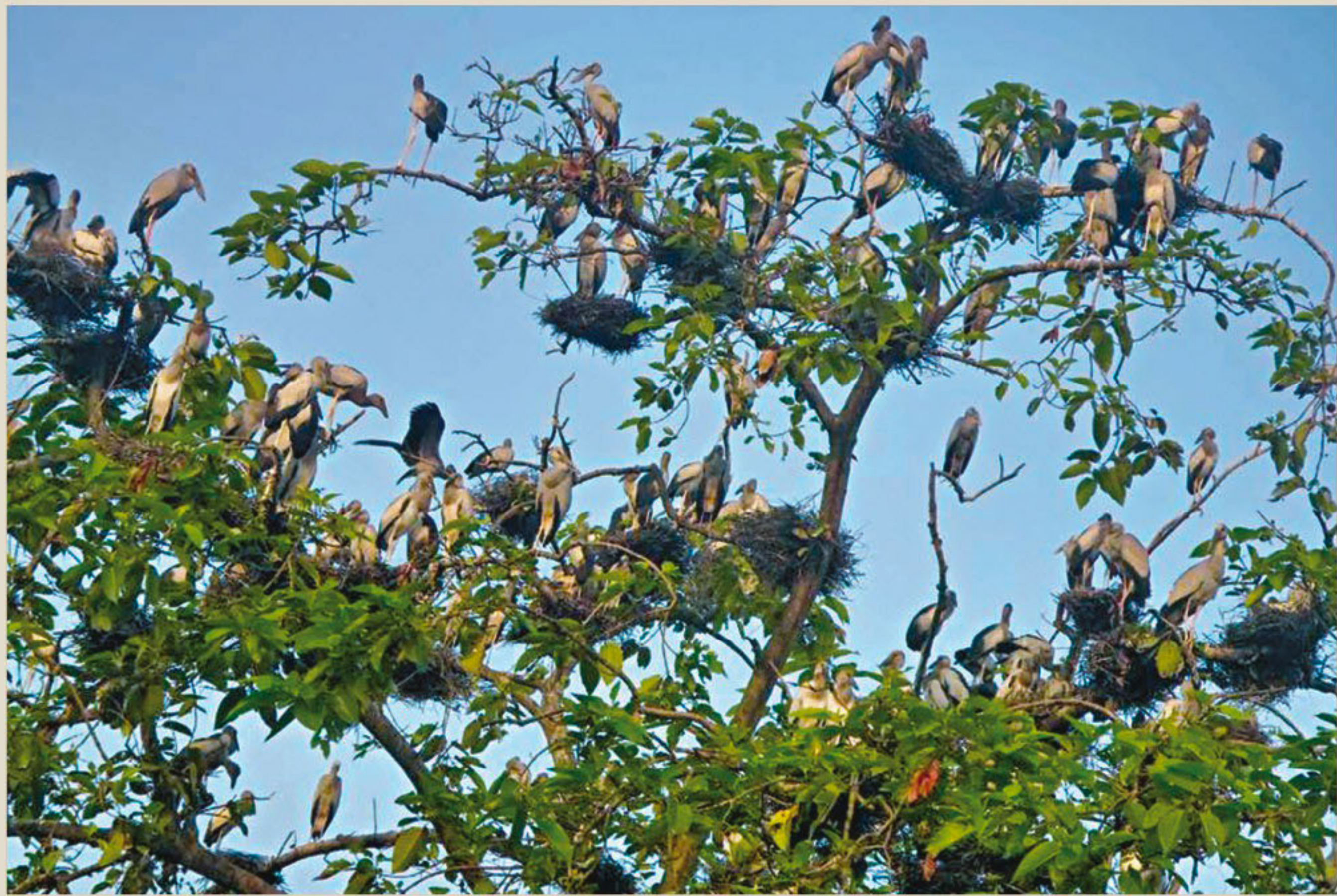
A flock of Shamuk-khol birds rest on a tree in Mollan village in Chapainawabganj Sadar upazila. A haven for the birds, the village has become an attraction for birders.