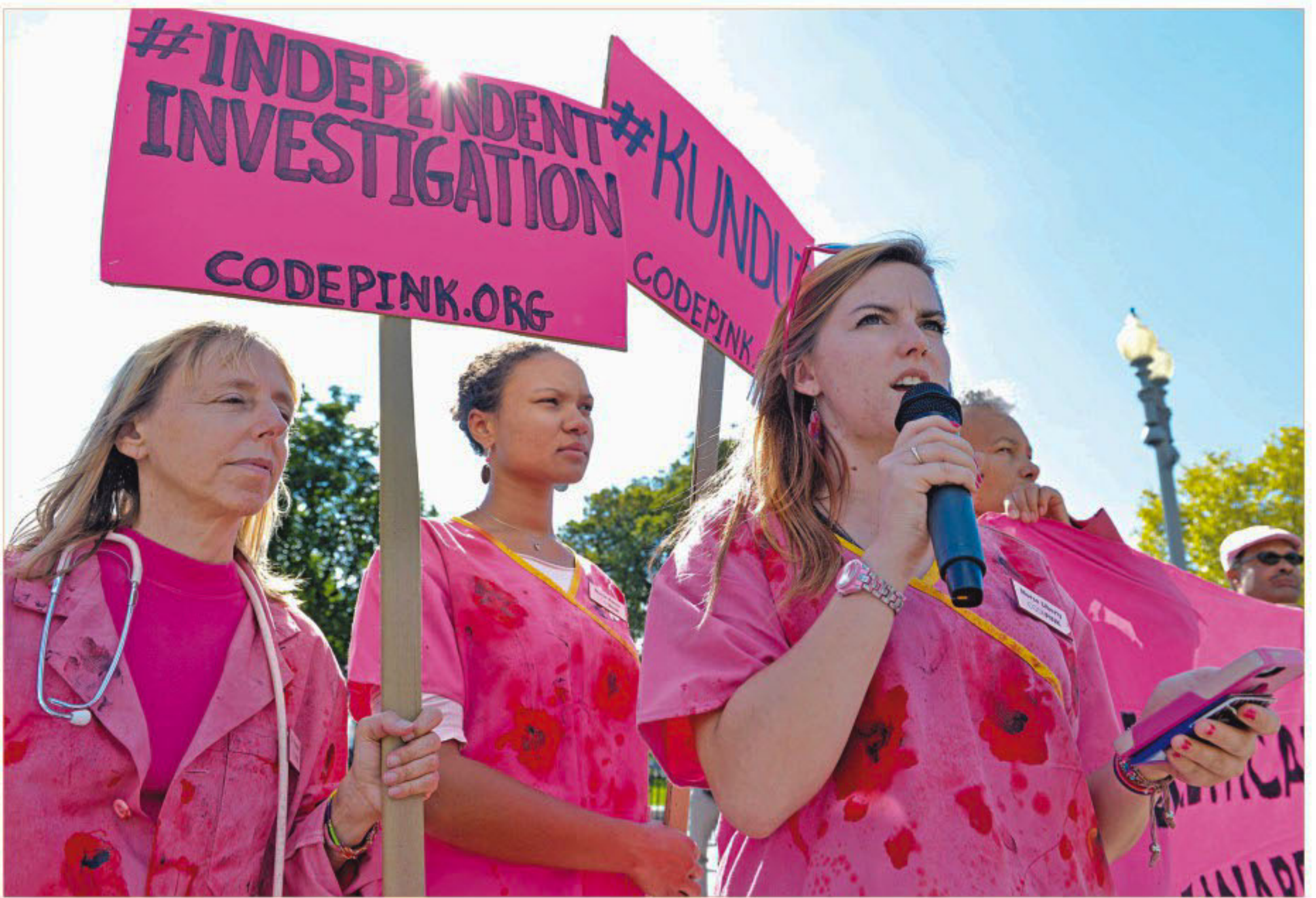
Protesters take part in a demonstration in front of the White House on Wednesday against the US military intervention in Afghanistan and the recent US air strike on a hospital of Doctors Without Borders in the Afghan city of Kunduz.