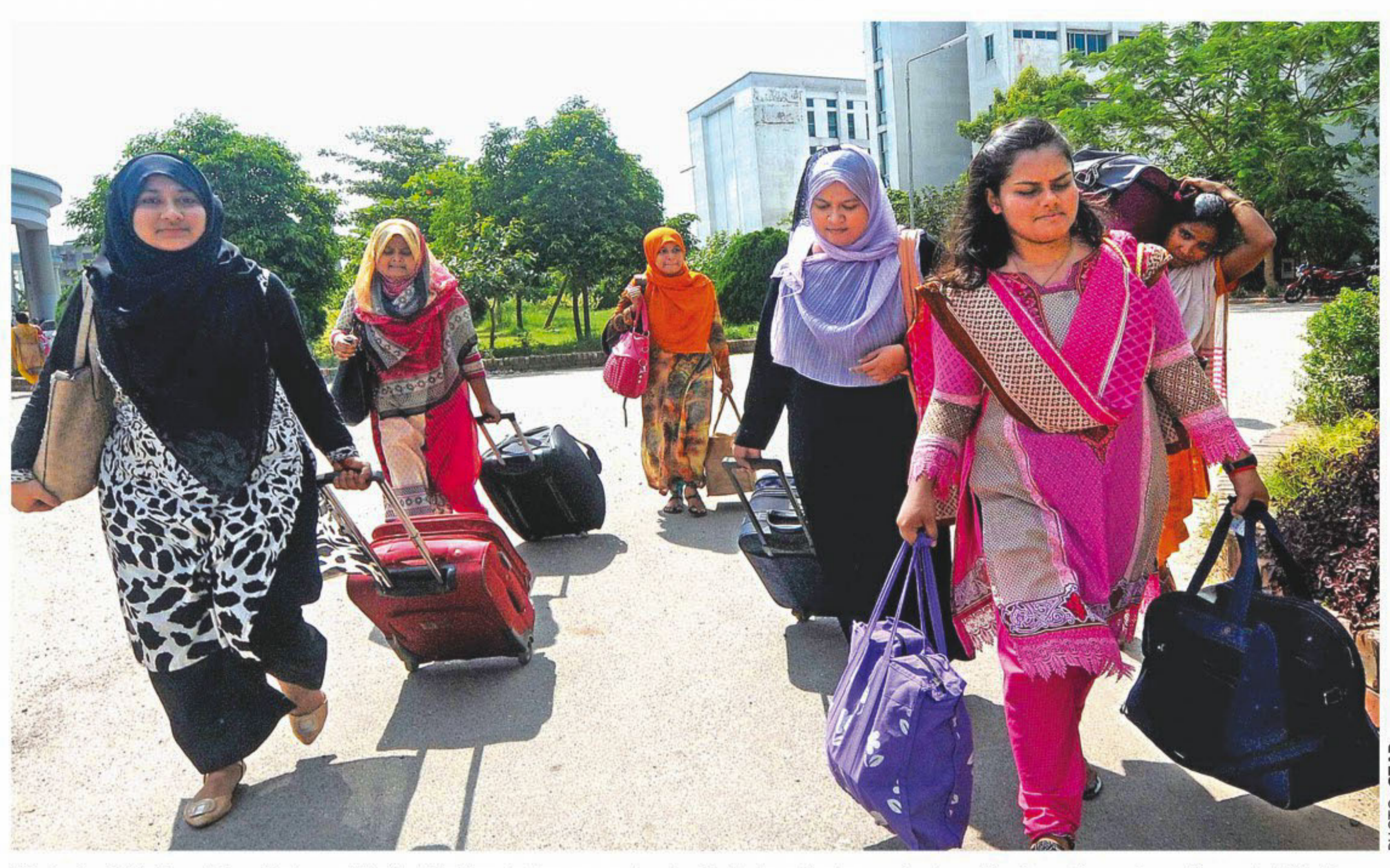
Students of Shaheed Ziaur Rahman Medical College in Bogra are leaving their dormitories yesterday after the college closed for an indefinite period following a clash between two factions of pro-ruling party Chhatra League reportedly over control of a dorm canteen on Tuesday night.

STAFF CORRESPONDENT The education ministry yesterday decided to reduce 10 marks from multiple-choice questions (MCQ) sections in SSC and HSC exams. The new score scheme will be effective from 2017. The decision to reduce the marks came at a meeting chaired by Minister Nurul Islam Nahid in the ministry's conference room. As per the decision, students have to answer MCQs of 30 marks instead of 40 and the papers which have MCQs containing 35 marks will now have questions for 25 marks, according to a press release. The meeting also decided that examinees will sit for the MCQ paper before the creative (written) section