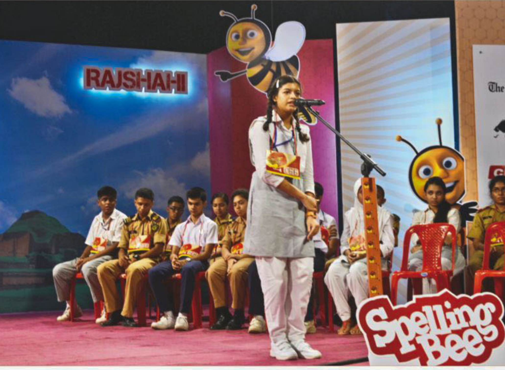
A contestant takes on a spelling challenge.