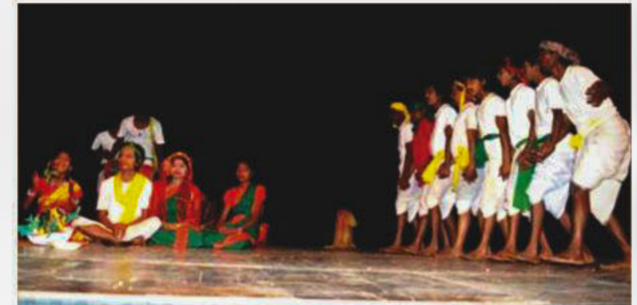
A scene from the play.

The performers were all members of Habiganj-based troupe Protik Theatre. Sunil Biswas's adaptation of "Nijbhume Porobashi" commemorates the deaths of hundreds of tea garden workers in the hands of British colonial rulers in 1921 during a revolt. At the beginning of tea cultivation in the region, tea labourers were brought here from different areas of the subcontinent,