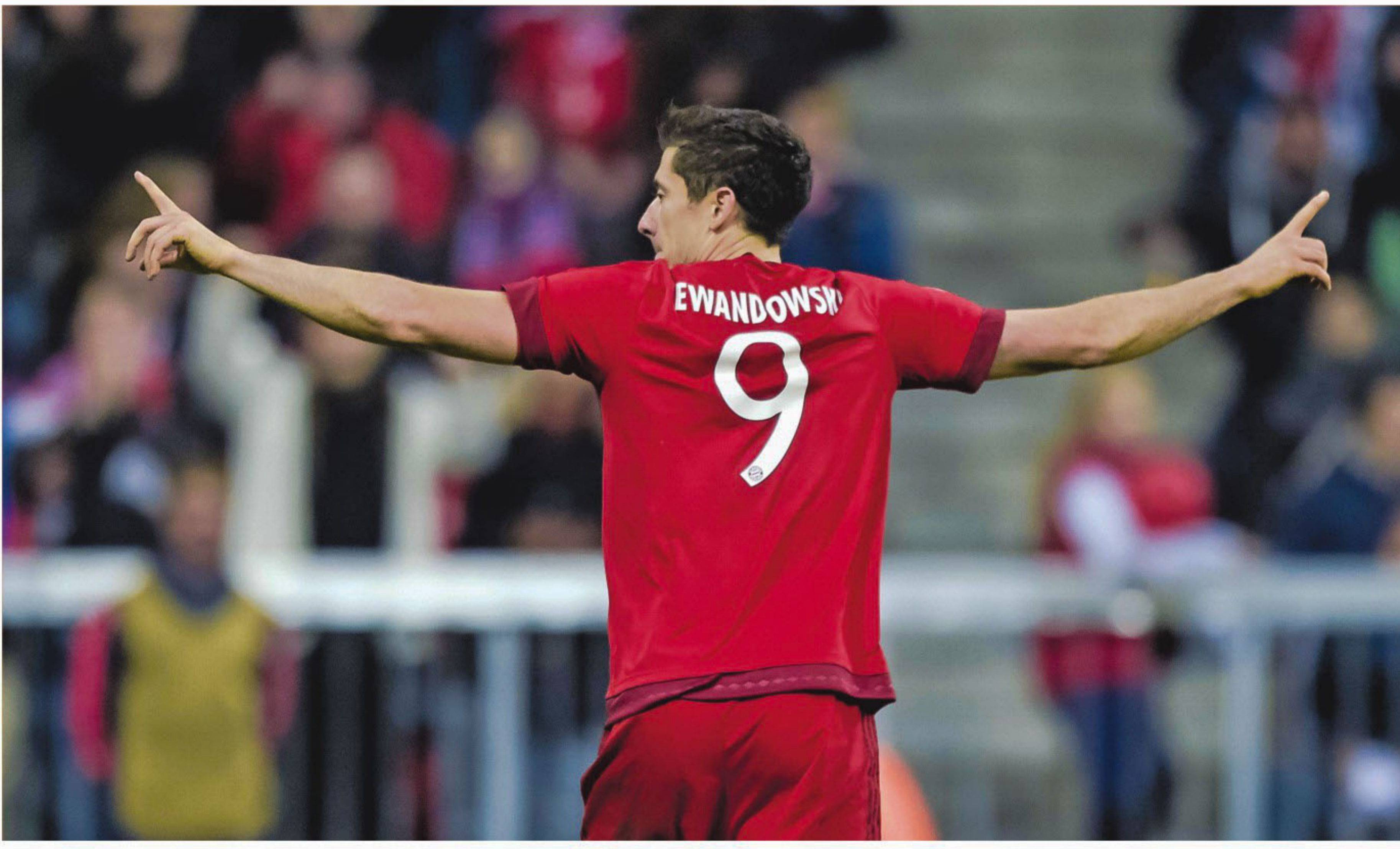
Bayern Munich striker Robert Lewandowski celebrates his hat-trick against Dinamo Zagreb during their Champions League encounter in Munich on Tuesday.

"He's had an unbelievable week behind him," admitted Lahm, who joked that he expects at least three goals from Lewandowski per game