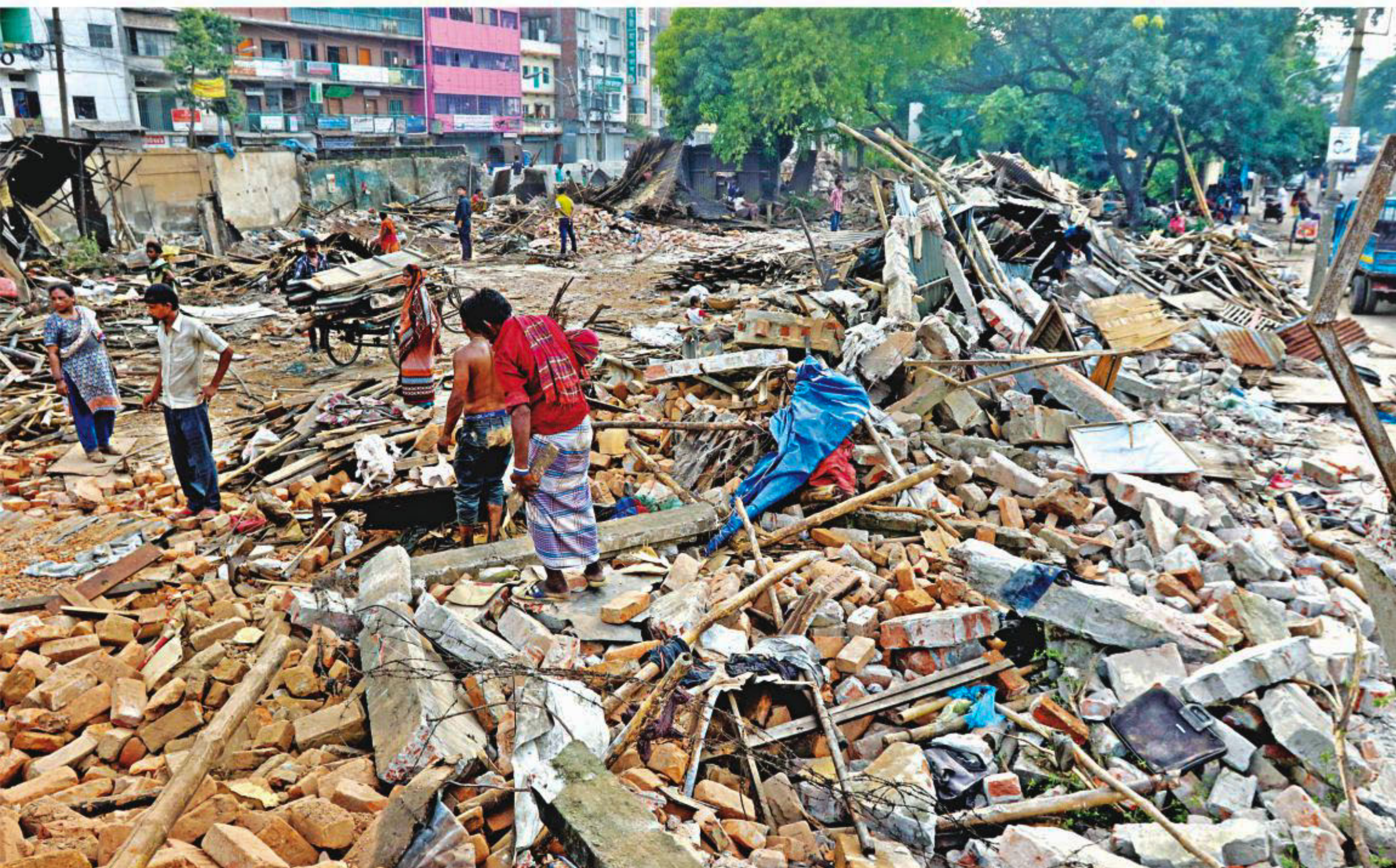
The Dhaka district administration under the supervision of the health ministry knocks down illegal structures and evicts occupants from a two-acre land in Chankharpool adjacent to Dhaka Medical College Hospital. The land, designated for building the 500-bed National Institute of Burn and Plastic Surgery, had been occupied for over two decades.