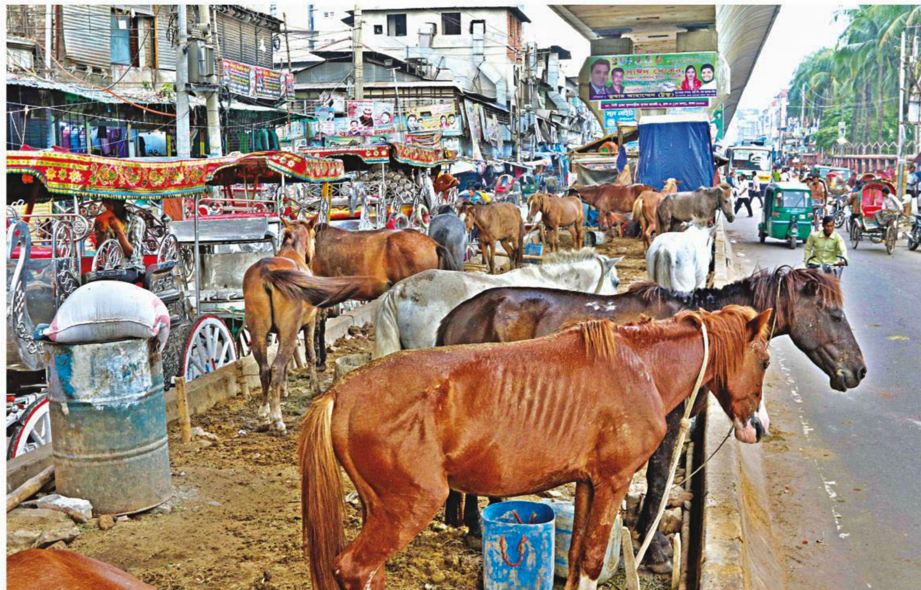
Don't mistake it for a stable. This is right under Mayor Mohammad Hanif Flyover in Ananda Bazar of Old Dhaka. Horse carts are part of the old town heritage, but keeping the animals on the divider makes the place stinky and unhygienic. Besides, the carts are parked occupying most of the lane on the left. The photo was taken yesterday.