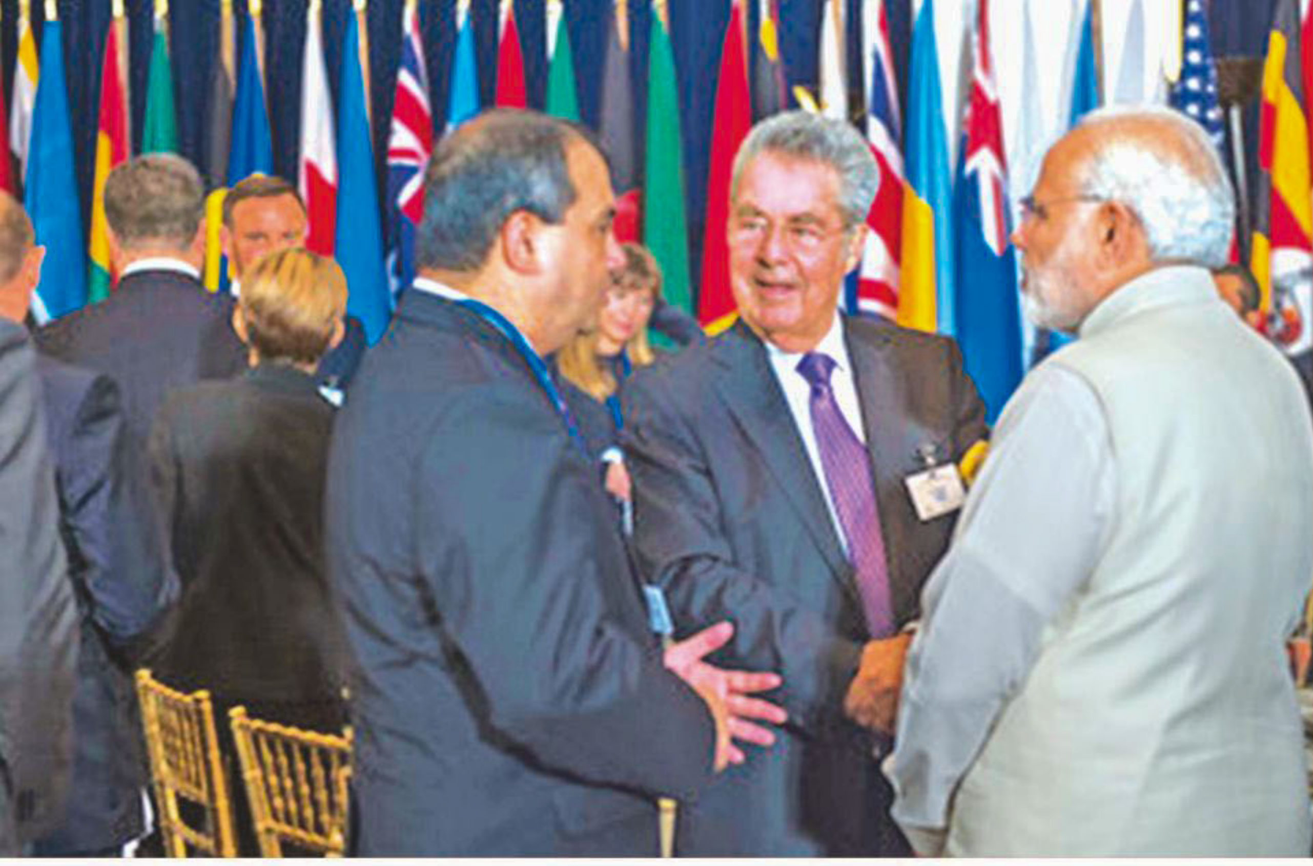
President of the Inter-Parliamentary Union Saber Hossain Chowdhury, left, Austrian President Heinz Fischer, centre, and Indian Prime Minister Narendra Modi at a luncheon hosted by Secretary-General of the United Nations Ban Ki-moon on Monday in New York for world leaders attending the general debate of the 70th session of the UN General Assembly.