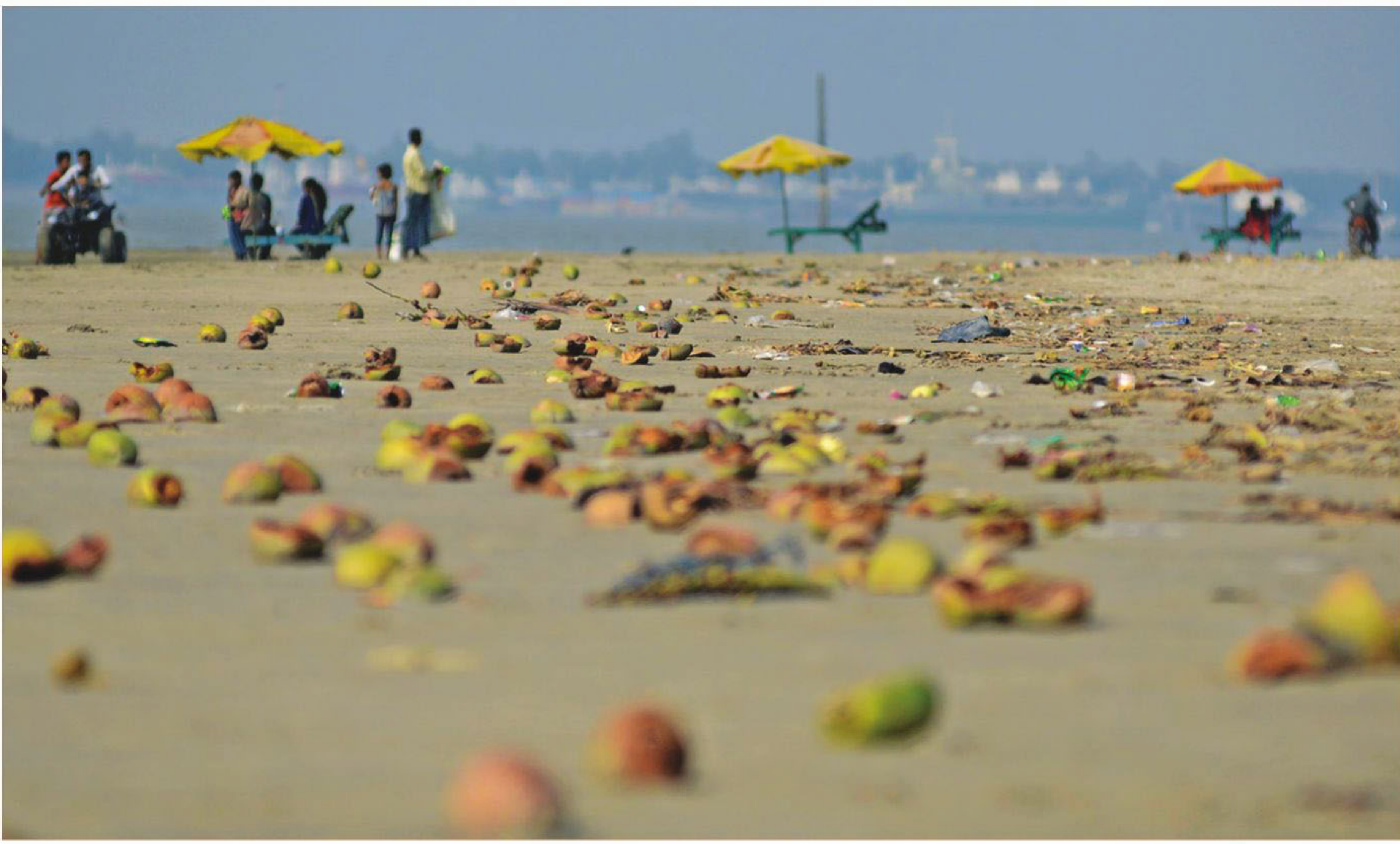
Coconut husks and rubbish litter the scenic Parki Beach in Chittagong's Anwara upazila. The spot draws a large number of visitors for being only 25-30km away from the port city and has potentials to draw more tourists. But carelessness of visitors and the authorities not only damages its beauty but pollutes the sea water. The photo was taken the day before Eid day.

UAE expatriate Shaheduzzaman, who is on the run, had sent the container to Chittagong declaring the container containing household commodities.