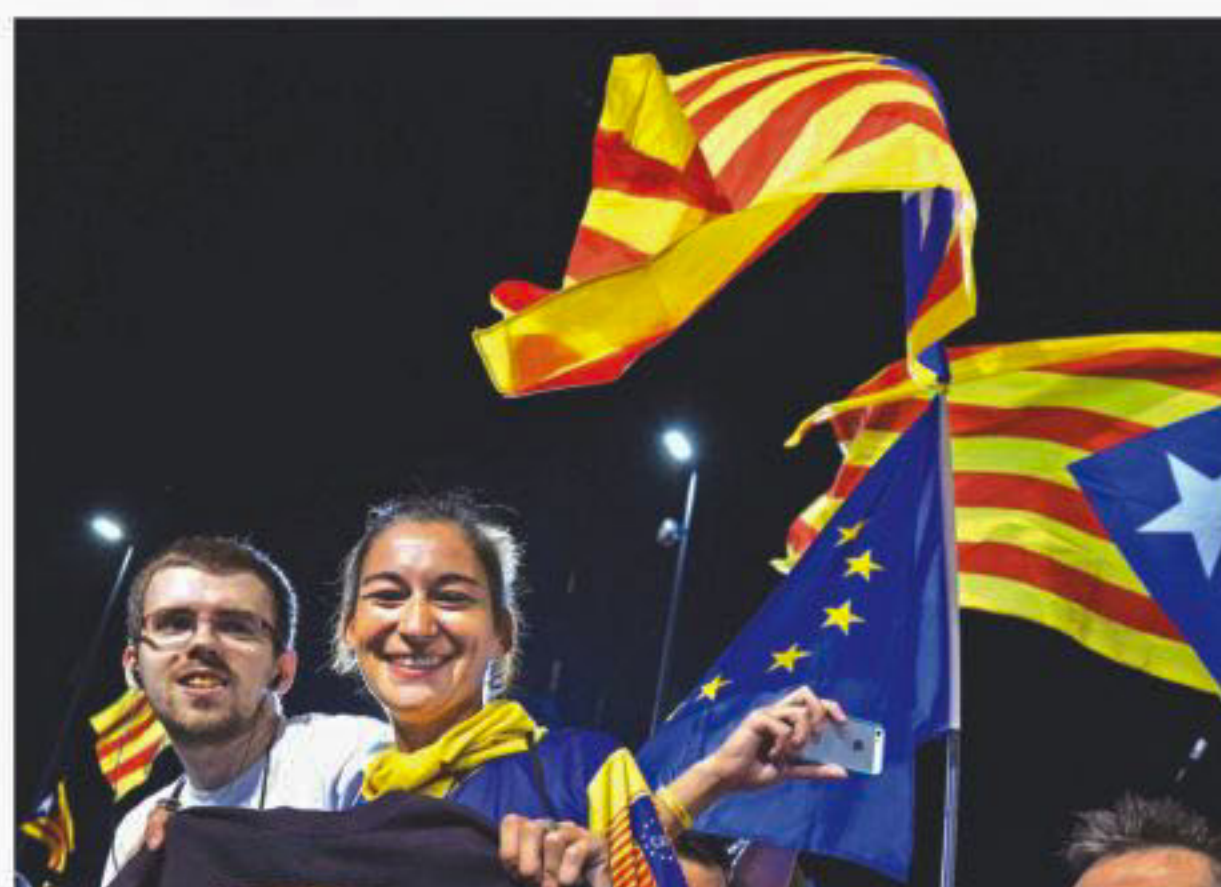
Catalan pro-independence supporters celebrate with European and Catalan flags following the closing of polling stations during Catalan regional elections in Barcelona, Spain on Sunday.