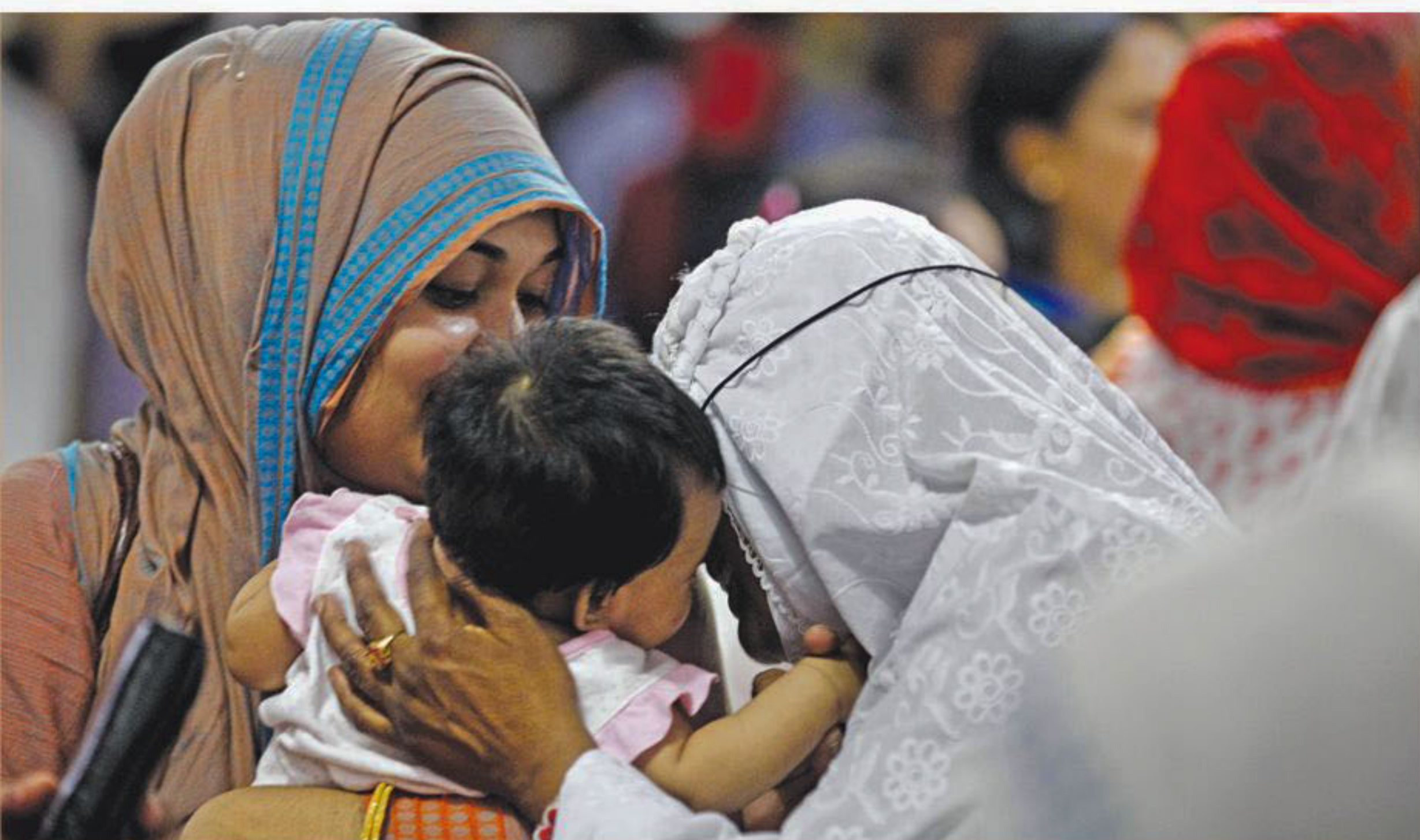
A woman, who along with 418 other pilgrims came from Saudi Arabia on the first Hajj return flight of Bangladesh Biman, is greeted by her relatives at Shahjalal International Airport last night. The return of the pilgrims was a relief for their families as hundreds, including Bangladeshis, died in a crane crash and a stampede during the Hajj this year.