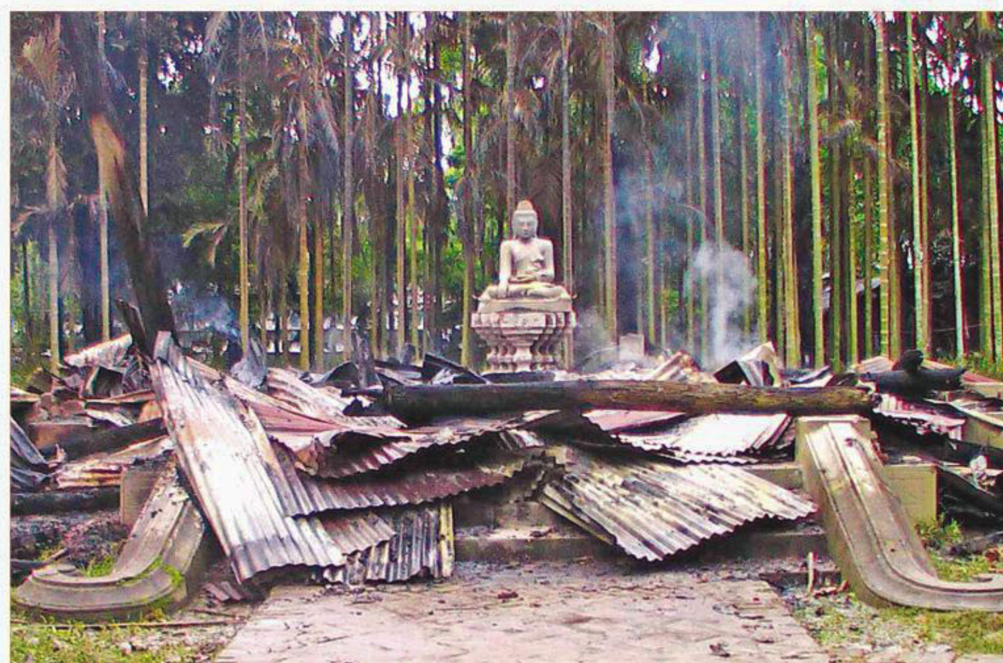
On this day three years ago, religious fanatics ran amok and destroyed 12 pagodas and more than 50 houses in Ramu of Cox's Bazar. The violence was touched off by rumours that a Buddhist youth had demeaned holy Quran on Facebook.