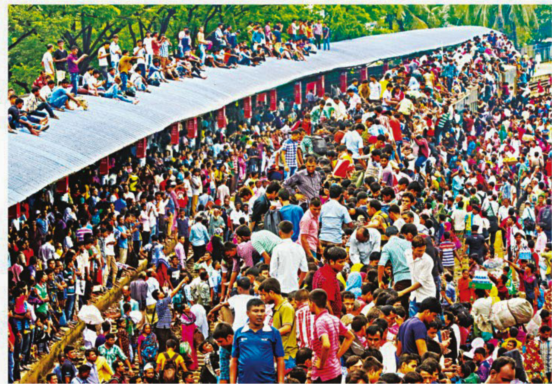
ANYTHING FOR HOME ... With only a day to go before the Eid-ul-Azha, holidaymakers make frantic efforts to climb up to the roofs of trains as the compartments are already packed. The photos were taken at the airport and the Kamalapur railway stations yesterday.