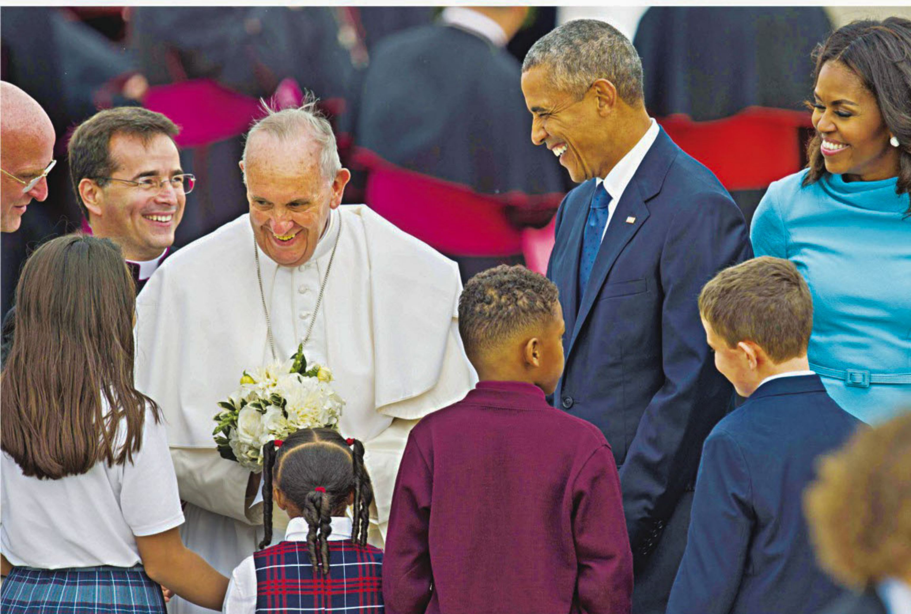
Pope Francis, accompanied by US President Barack Obama and First Lady Michelle Obama, greets children upon his arrival at Andrews Air Force Base in Maryland on Tuesday on a three-day visit to Washington.