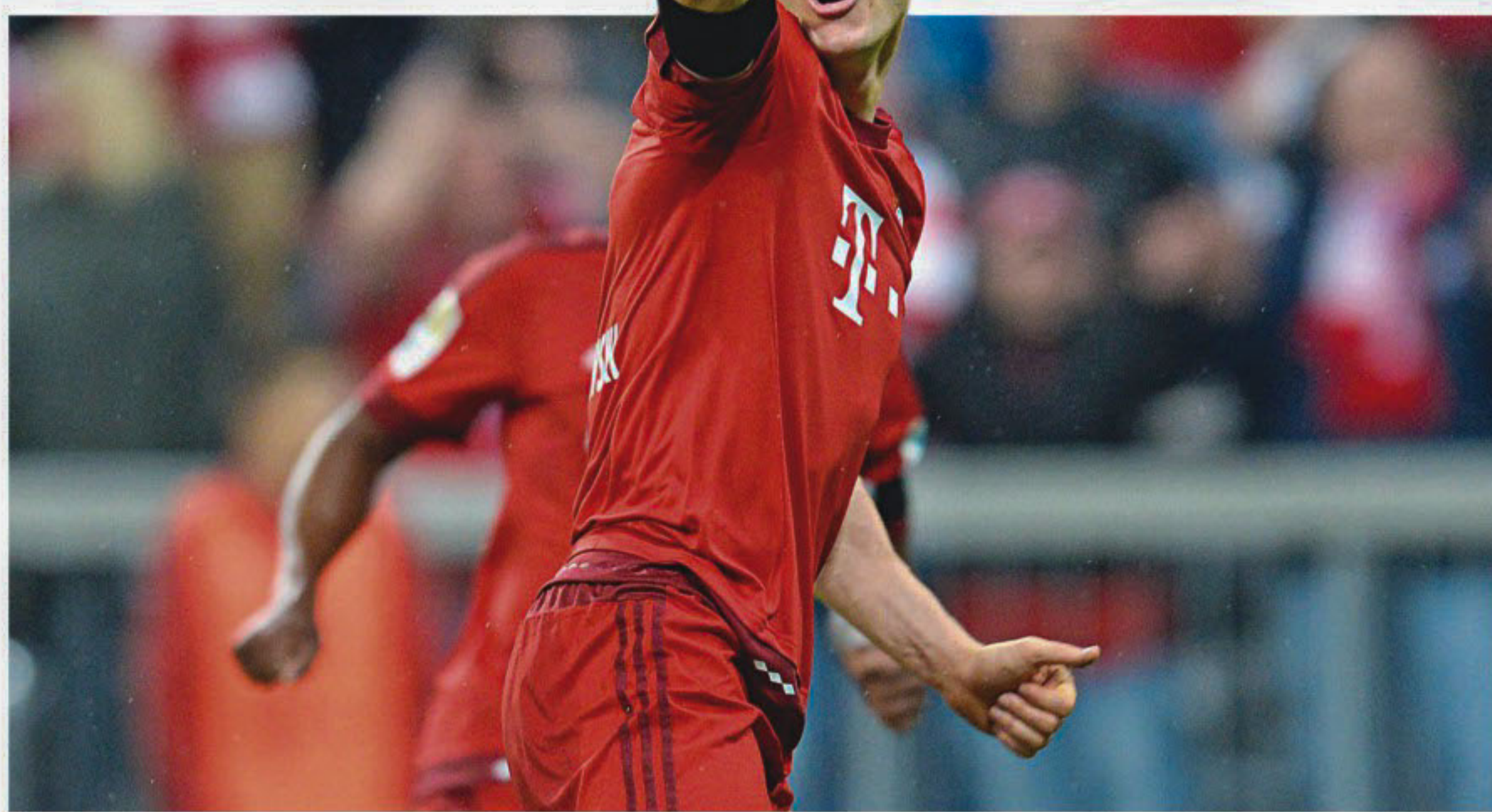
Bayern Munich striker Robert Lewandowski shows five fingers after his stunning 9 minute quintuple against Wolfsburg during their Bundesliga encounter in Munich on Tuesday.