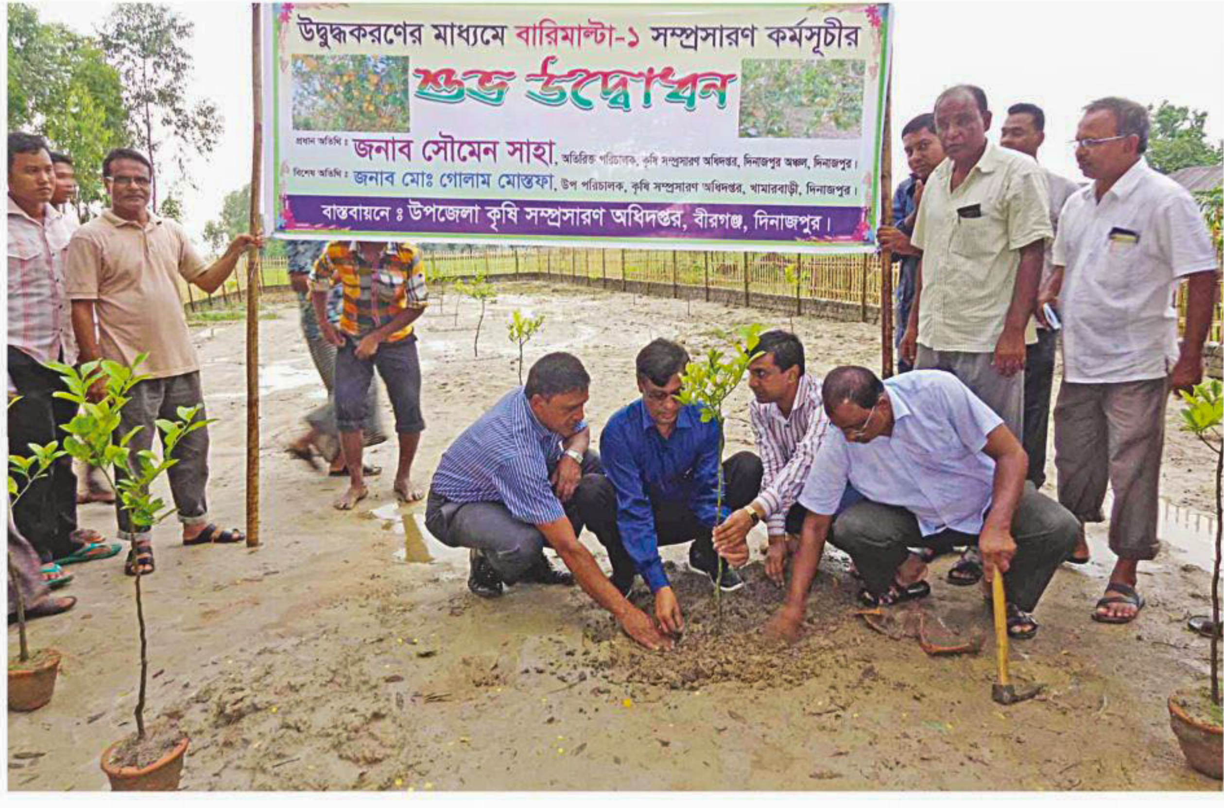
Officials of the Department of Agriculture Extension plant malta at Komorpur village in Birganj upazila under Dinajpur district during inauguration of a citrus fruit cultivation centre a few days ago.