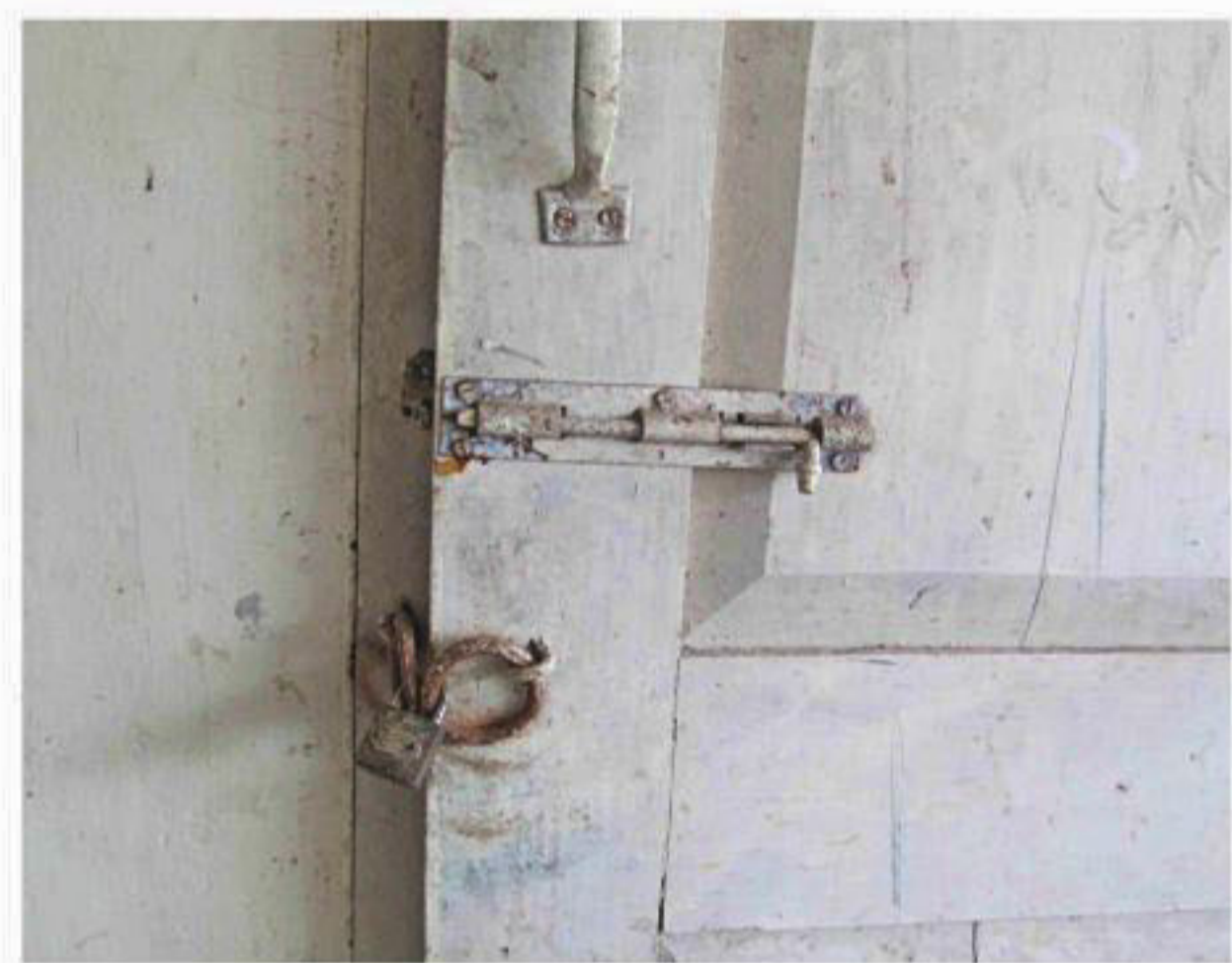
The lone toilet meant for outdoor patients of Pirojpur Sadar Hospital remains locked all the time, much to the sufferings of the treatment seekers and their attendants, especially those coming from distant areas.