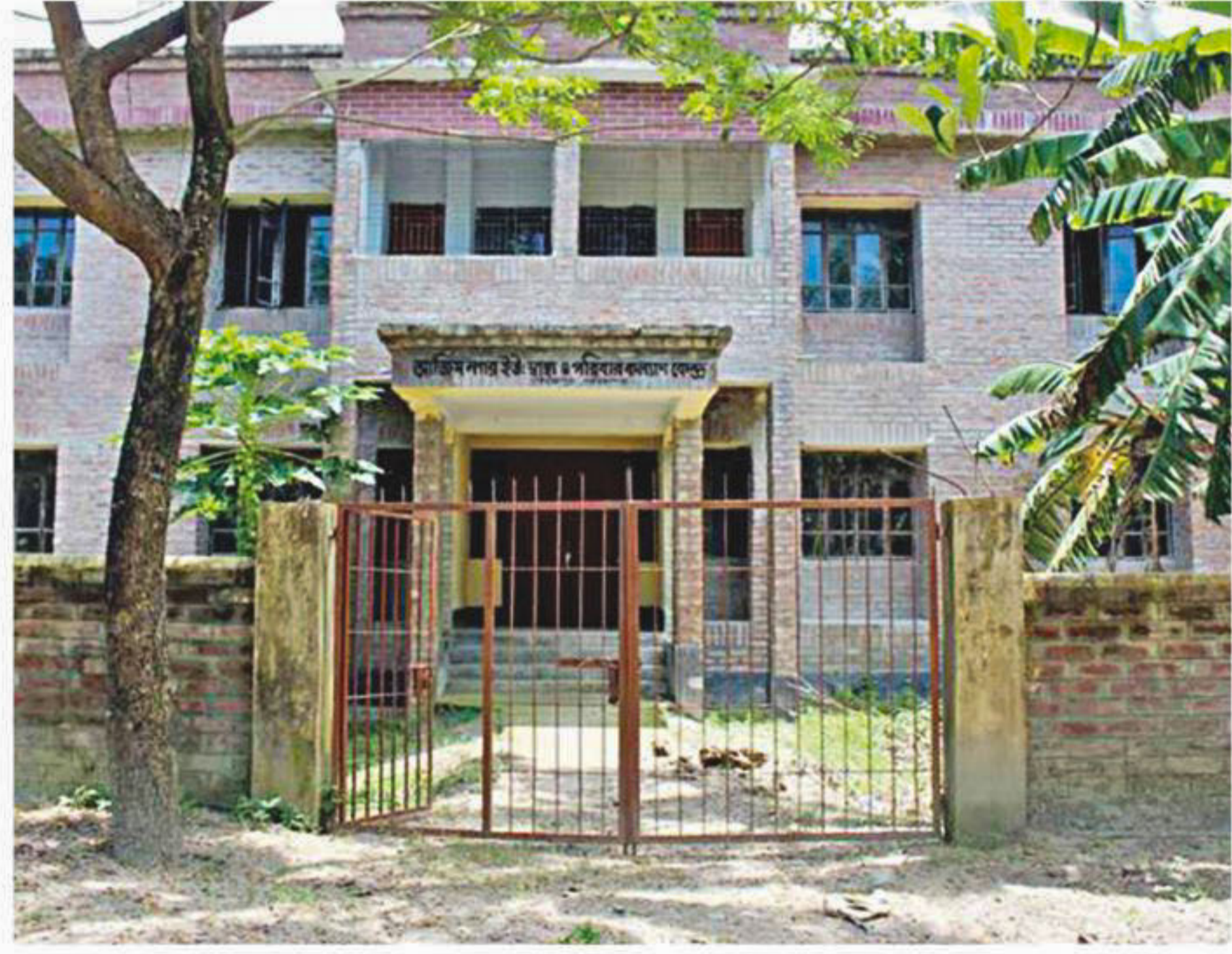
With an impressive building and required medical instruments, Azimnagar union health and family planning centre in Harirampur upazila under Manikganj district remains a mockery for locals as it could not be opened for service in last one and a half years due to lack of doctors and other staff.