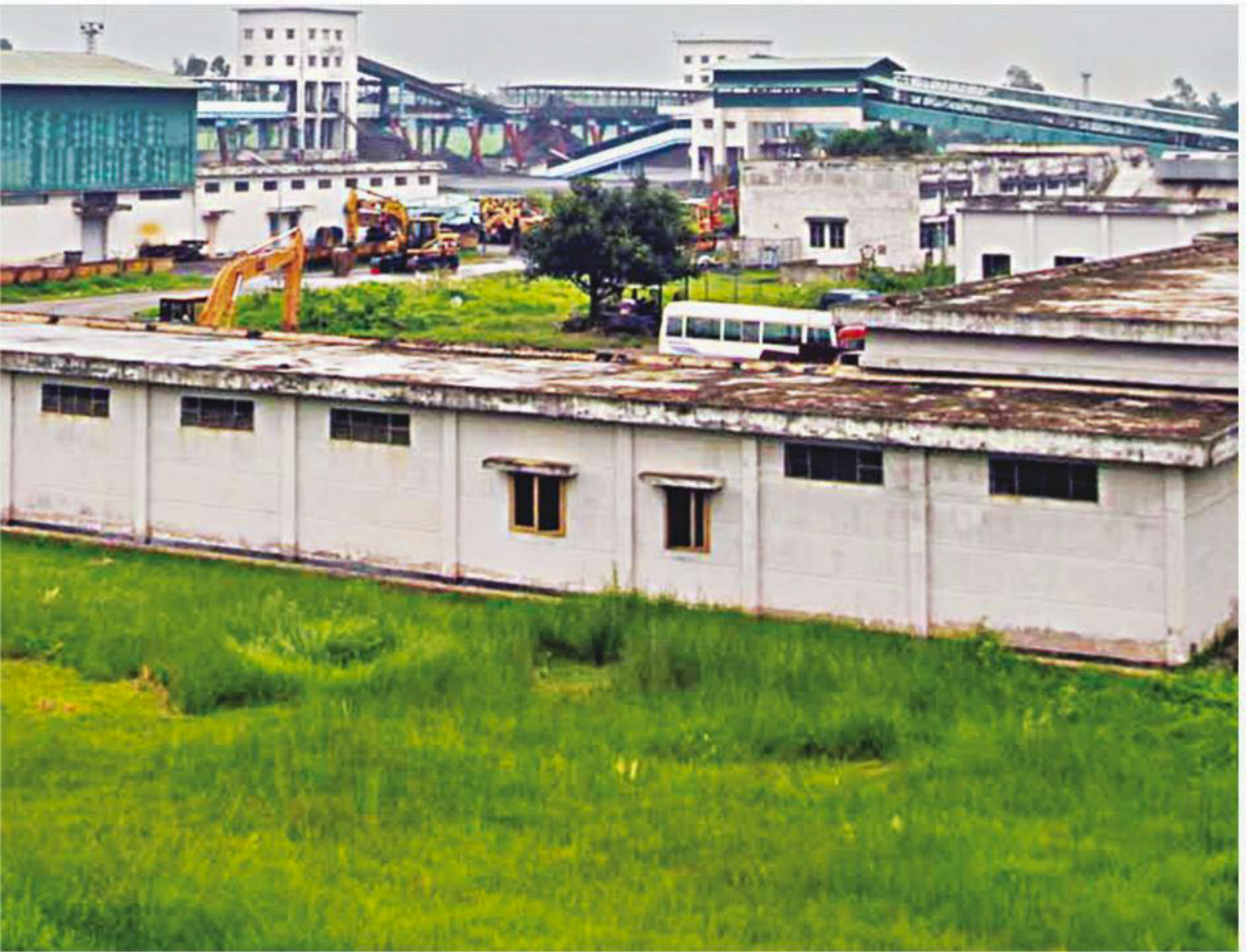
The premises of Madhyapara Granite Mining Company Ltd in Parbatipur upazila under Dinajpur district give a deserted look as the authorities stopped production yesterday, following exhaustion of stocks of existing five stoves there.