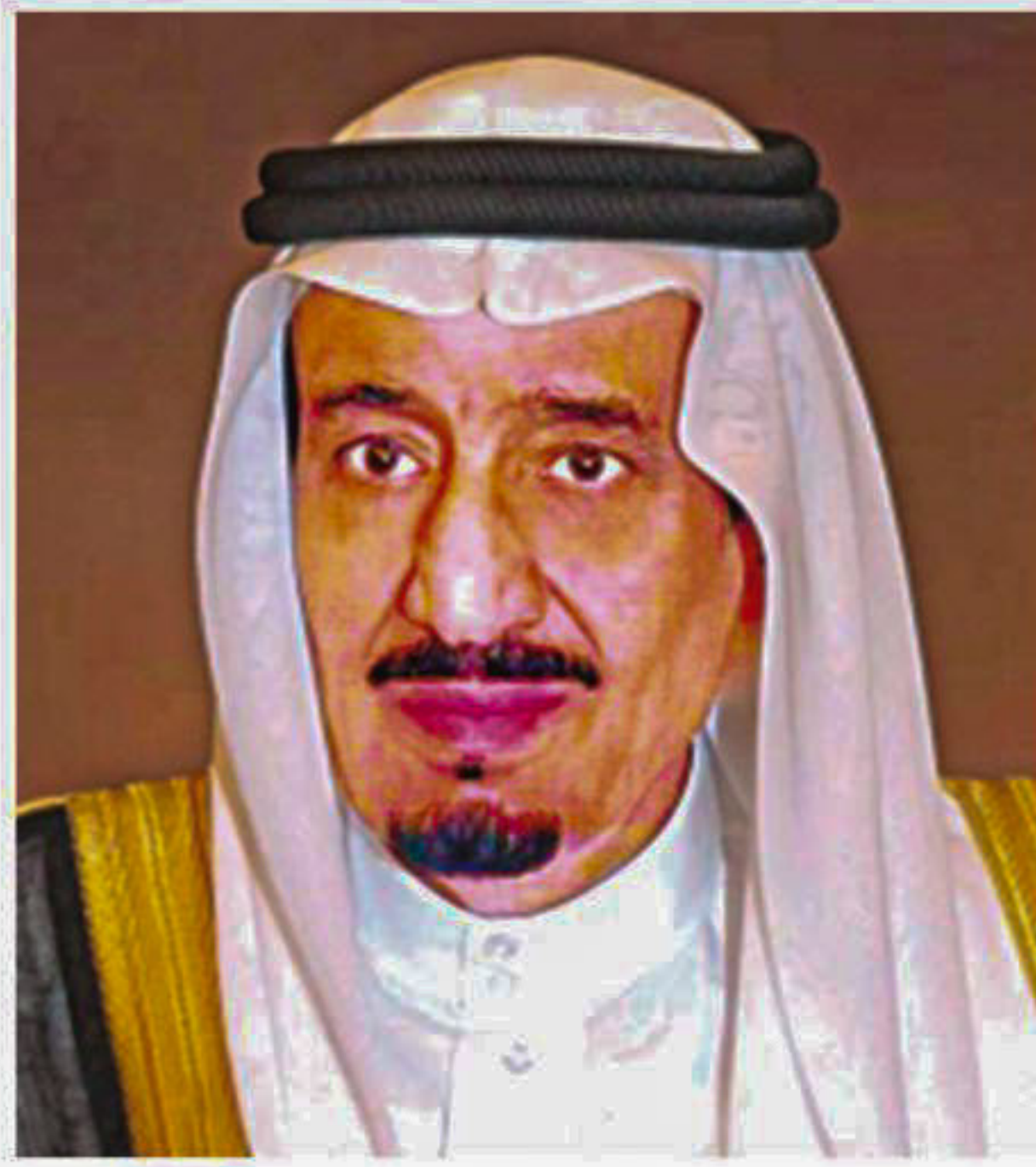
Custodian of the Two Holy Mosques King Salman Bin Abdulaziz Al-Saud

It may be mentioned in this august occasion the enormous services rendered by the Kingdom for Arabic and Islamic nation. It is not a matter of strange for this country. It is a place of revelation, starting point of heavenly message and qibla of Muslims. It has given preference and emphasis since its establishment on Islam and Muslims. So it has built Alla's mosques in all parts of the world beginning the Two Holy Mosques which have witnessed in the rein of the Saudi government the biggest expansion throughout all ages. So, the Hajj rituals have become very easy after it had been very difficult. The Holy Mosques have become pride for all Muslims. The comfort of the pilgrims of Allah's house and the visitors of the mosque of the Prophet (peace be upon him) has been given most priority to provide