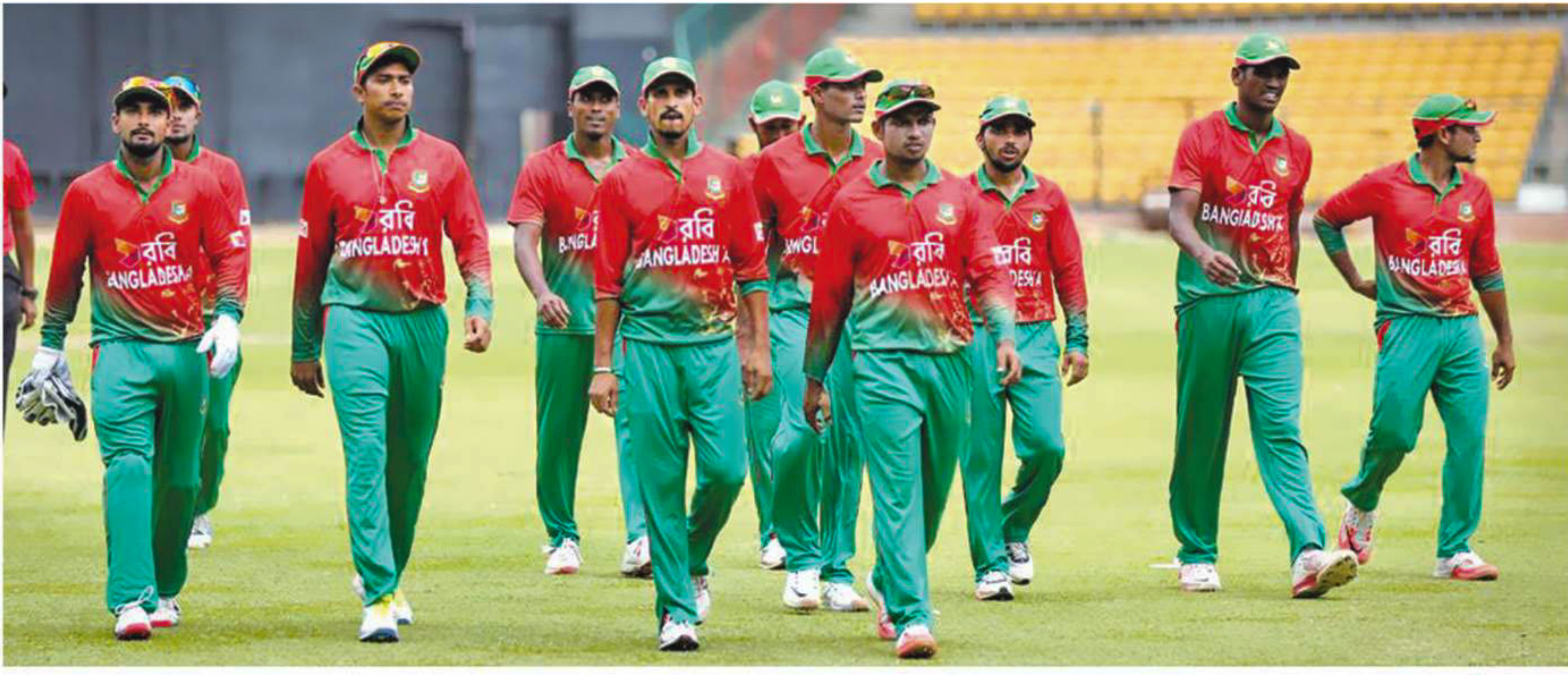
Dejected Bangladesh A players walk towards the dressing room after their Indian counterparts posted a mammoth 297 during the final one-day in Bangalore yesterday. The visitors failed to keep up with the chase and lost the series 2-1.