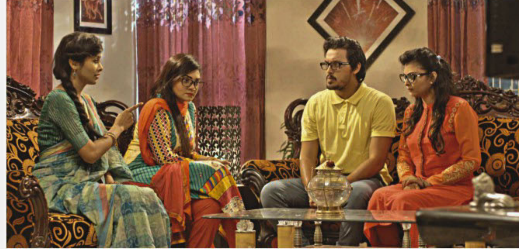
"Noakhali to Chittagong" is one of the plays to air on Gtv this Eid.