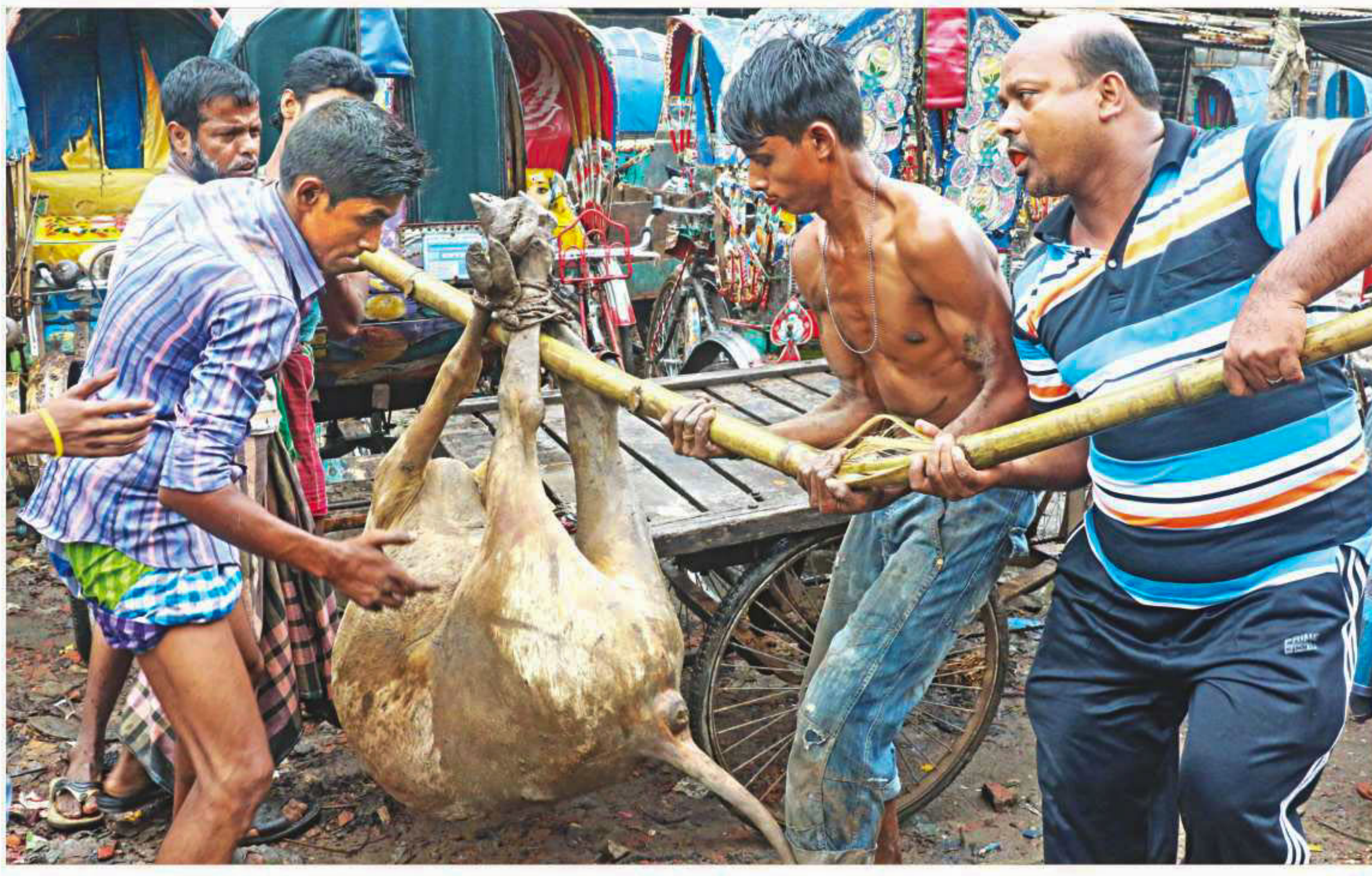
A cow being hurriedly taken to a suitable place for slaughter after it had already died at an illegal cattle market right next to the rail tracks in Kamalapur of the capital yesterday. The man on extreme right claimed that he had bought the dead cow for Tk 6,000. Others in the market alleged that this kind of trade only happens for selling the dead animal's meat at a bargain basement price to roadside restaurants or on the streets of low-income neighbourhoods. The cattle trader who brought the bovine from Kushtia to the market said he had bought it for Tk 30,000.

They kept the residents at gun point, and looted cash and valuables from the first and second floors of the four-storey building, said Khilgaon police. At one stage, the robbers hacked Kochi and Farid while they were trying to resist them, he added. A case was filed while police picked up some persons for interrogation.