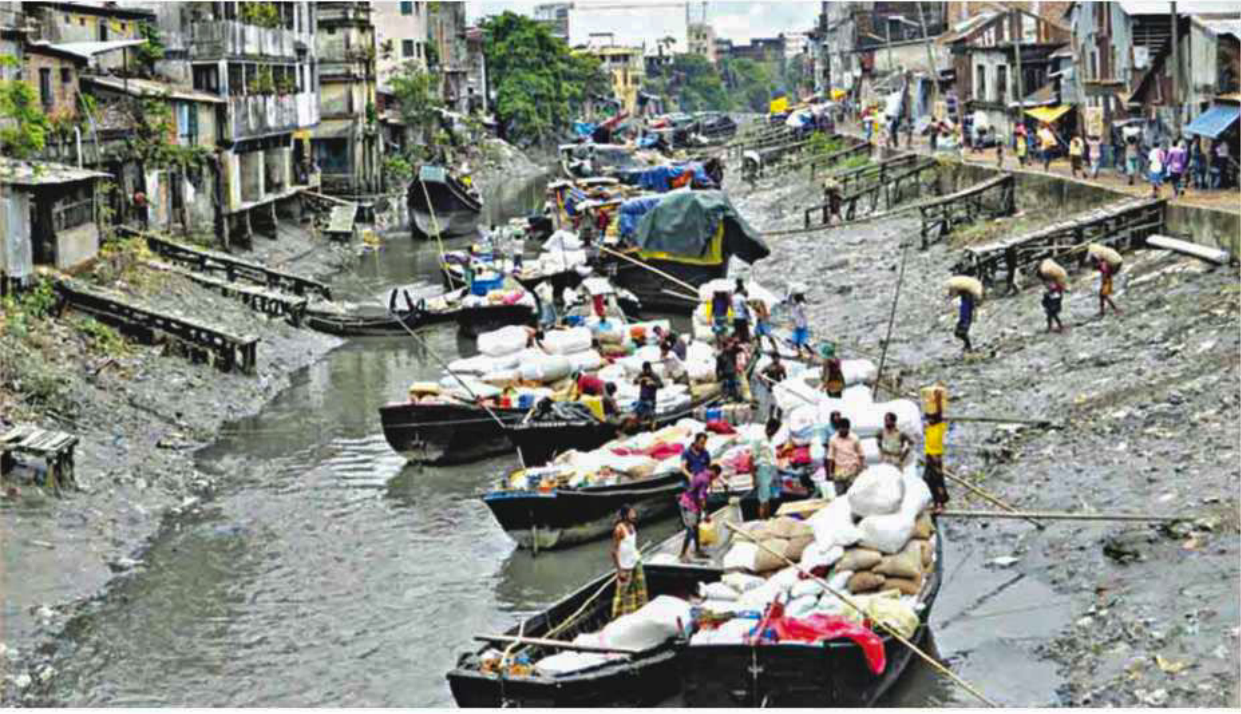
The wholesale market of Khatunganj in Chittagong city sending goods to grocers and small traders by boat ahead of Eid-ul-Azha when sales will see a huge boost. However, the canal that serves as a major commercial route is in death throes because of continuous encroachment on both sides. Local residents say once merchant boats sailed on Chaktai Khal but today it is just a stream that does not get water even during the monsoon. The photo was taken yesterday.