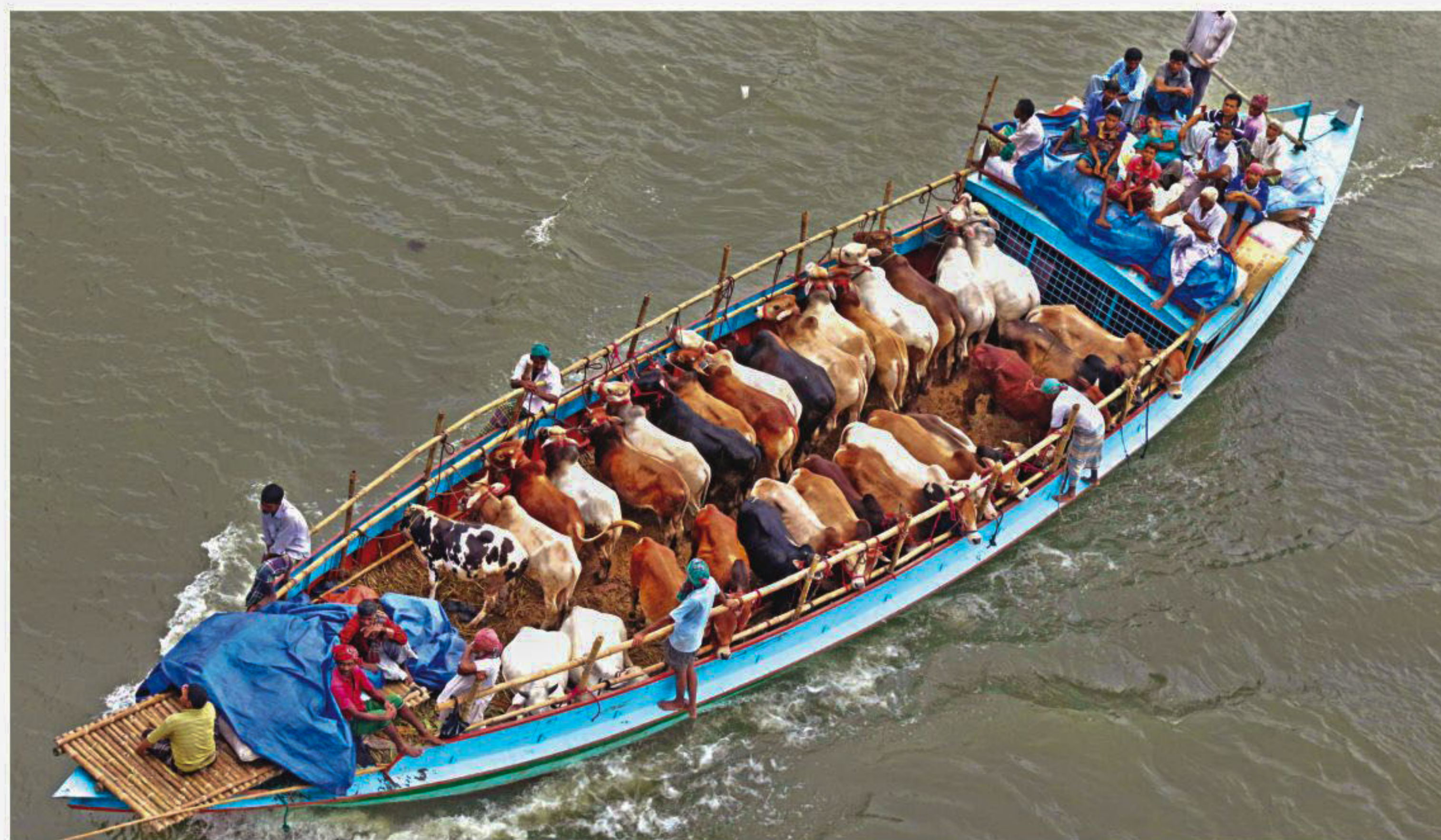
With Eid-ul-Azha just five days away, traders are bringing cattle to the capital, the biggest market for sacrificial animals in the country. The photo taken yesterday shows a boatload of cattle entering Dhaka through the Buriganga.