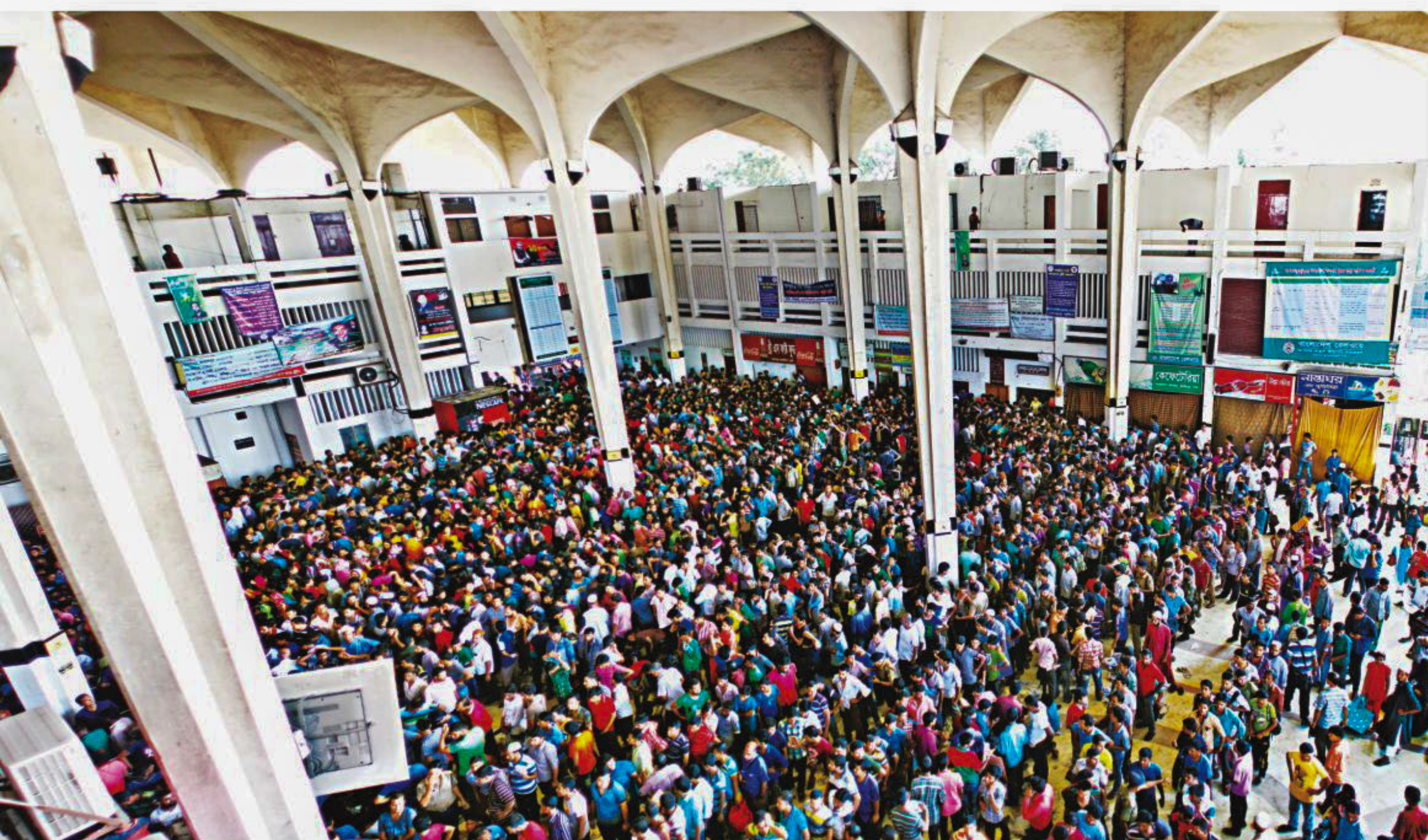
People standing in long queues at Kamalapur Railway Station, scrambling up to collect tickets for September 23. The photo was taken yesterday when sales of advance tickets for Eid began.

SEPTEMBER 19 Fazr Zohr Asr Maghrib Esha AZAN 4-35 12-45 4-30 6-09 7-45 JAMAAT 5-10 1-15 4-45 6-12 8-15 SOURCE: ISLAMIC FOUNDATION