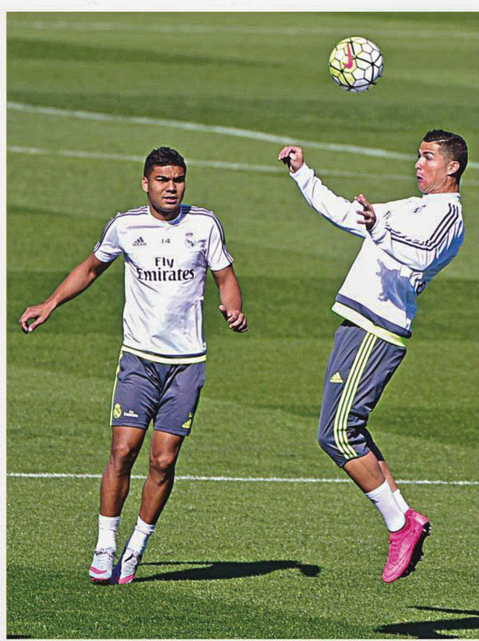
Real Madrid superstar Cristiano Ronaldo (R) heads the ball during a training session at Valdebebas Sport City in Madrid yesterday.

Another piece of Real Madrid history awaits Cristiano Ronaldo as he can become the club's all-time leading scorer when they host Granada at the Santiago Bernabeu on Saturday. Ronaldo is officially just two goals shy of Raul Gonzalez Blanco's 323-goal record despite having played over 400 games fewer than the Spanish legend. However, the club claim he is just one goal behind Raul as they credited Ronaldo with a goal back in 2010 that was awarded to Pepe in the referee's report. The World Player of the Year has struck eight times in his last two games to categorically silence the critics for his slow start to the campaign as he failed to score in either of Madrid's opening two La Liga fixtures or in two games for Portugal. Ronaldo hit five goals in the same game for the second time in five months in a 6-0 rout at Espanyol last weekend and Granada will be fearing the worst as they were the previous recipients of a five-goal haul in a 9-1 humiliation at the Bernabeu back in April. "I am happy, it is a proud moment for me to be in this position," Ronaldo said after netting his 33rd hat-trick for the club against Shakhtar Donetsk in midweek. "I have to thank the team, they helped me a huge amount. "Before I was bad and now I am good because I have scored eight goals," he added in a thinly veiled dig at his critics. "My teammates believe in me, they give me the service with which I scored goals." Ronaldo will, though, be devoid