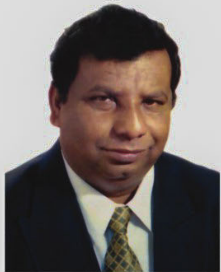
Syed Mohsin Ali

I was deeply saddened by the news of Social Welfare Minister Syed Mohsin Ali's death on September 14. I first saw him on the front page of The Daily Star , standing with a cigarette in his hand, a large audience in front of him. I began reading the news story only to find that he was from Sylhet, where also lies my childhood connection. His cigarette seemed to have had quite an impression on the whole nation!