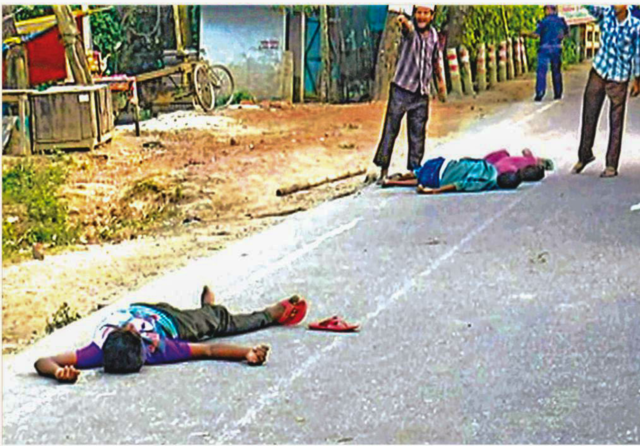
Three of the six bullet-hit youths, who were shot during a clash with police, lying on a street in Kalihati upazila of Tangail yesterday. The clash broke out when people from several villages of Kalihati and Ghatail upazilas, protesting torture on a woman and her son, attempted to lay siege to Kalihati Police Station. More photos on page 2.