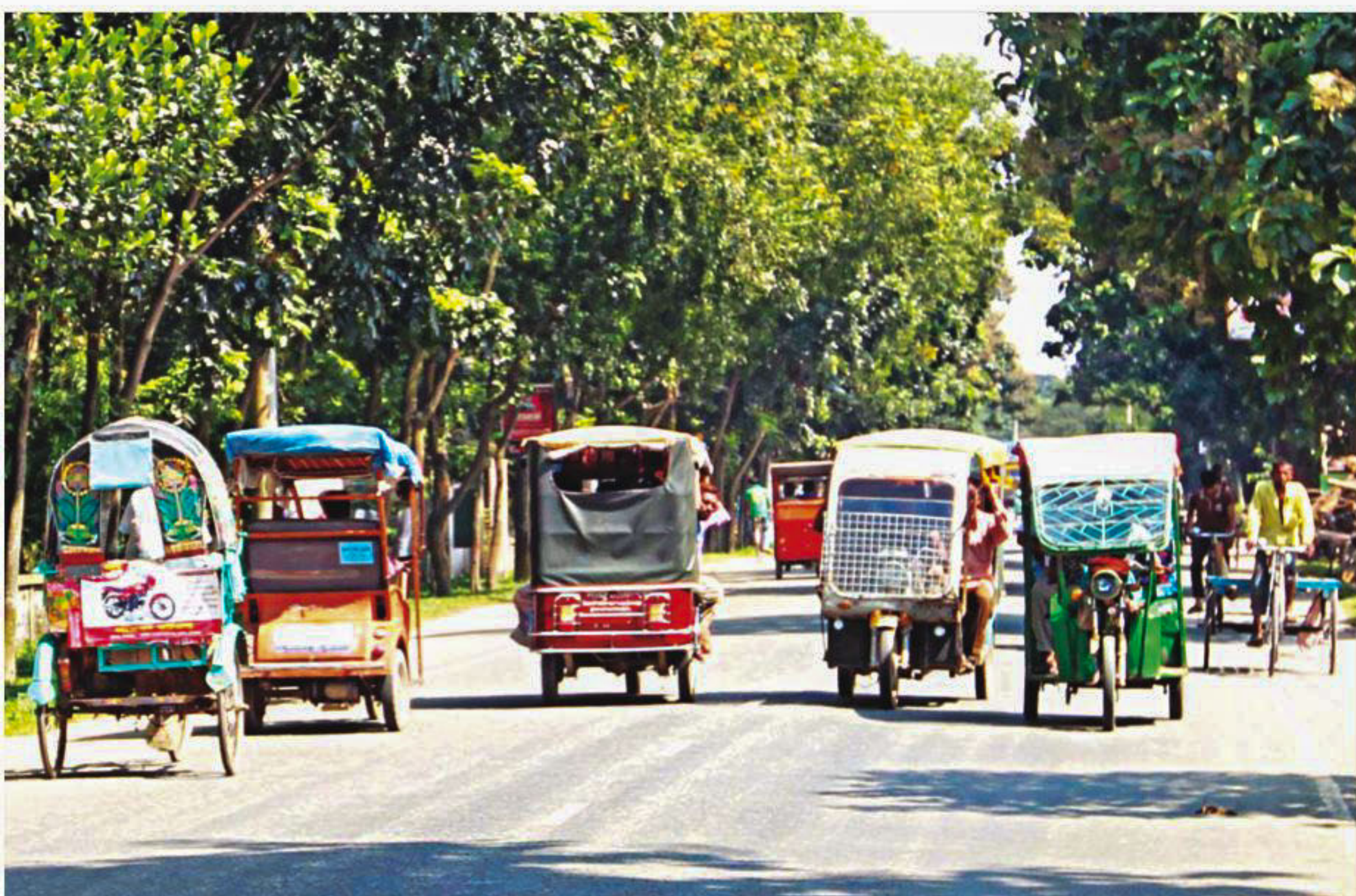
Battery-run three wheelers ply highways despite a government ban. Such small, flimsy vehicles multiply risks of accidents ahead of Eid when the number of heavy vehicles overly increases on the highways. The photo was taken yesterday on the Dinajpur-Rangpur highway.