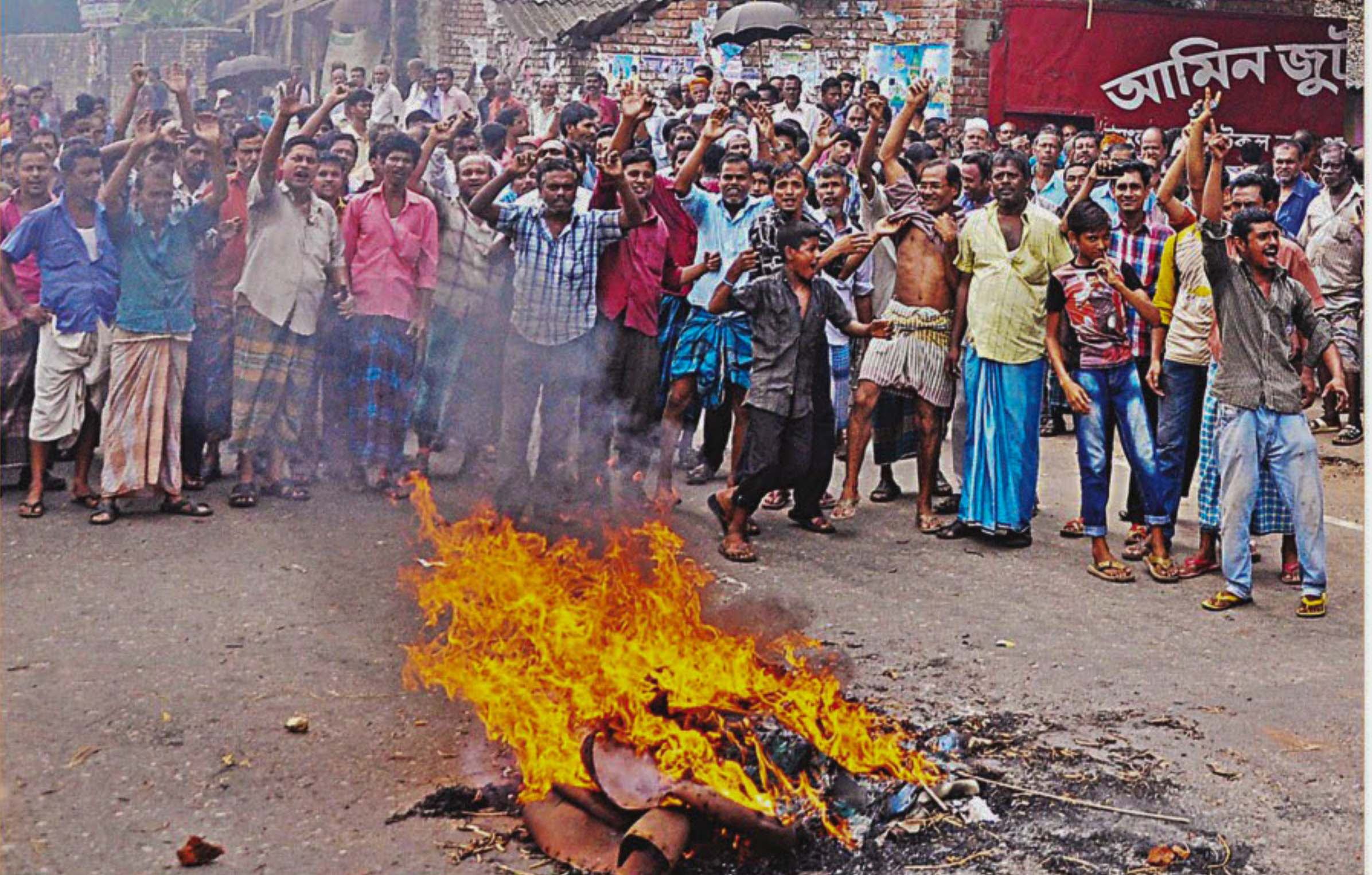
Workers of Amin Jute Mills Ltd set fire to substances on Chittagong-Hathazari road in Chittagong city yesterday demanding their arrears of two months. They also blocked the road for two hours.