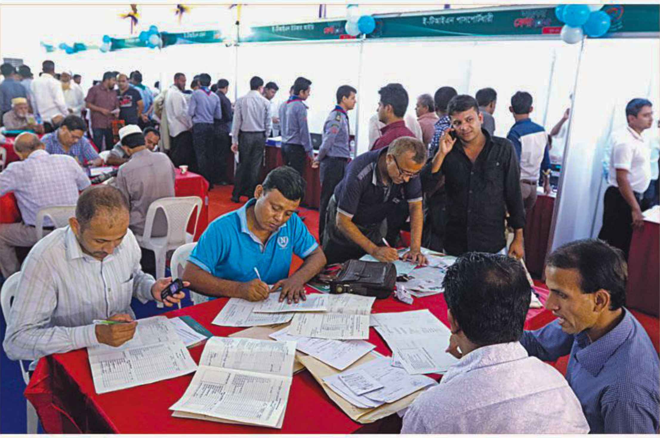
Taxpayers fill out forms at the tax fair in Chittagong. The annual event also began in Dhaka yesterday.