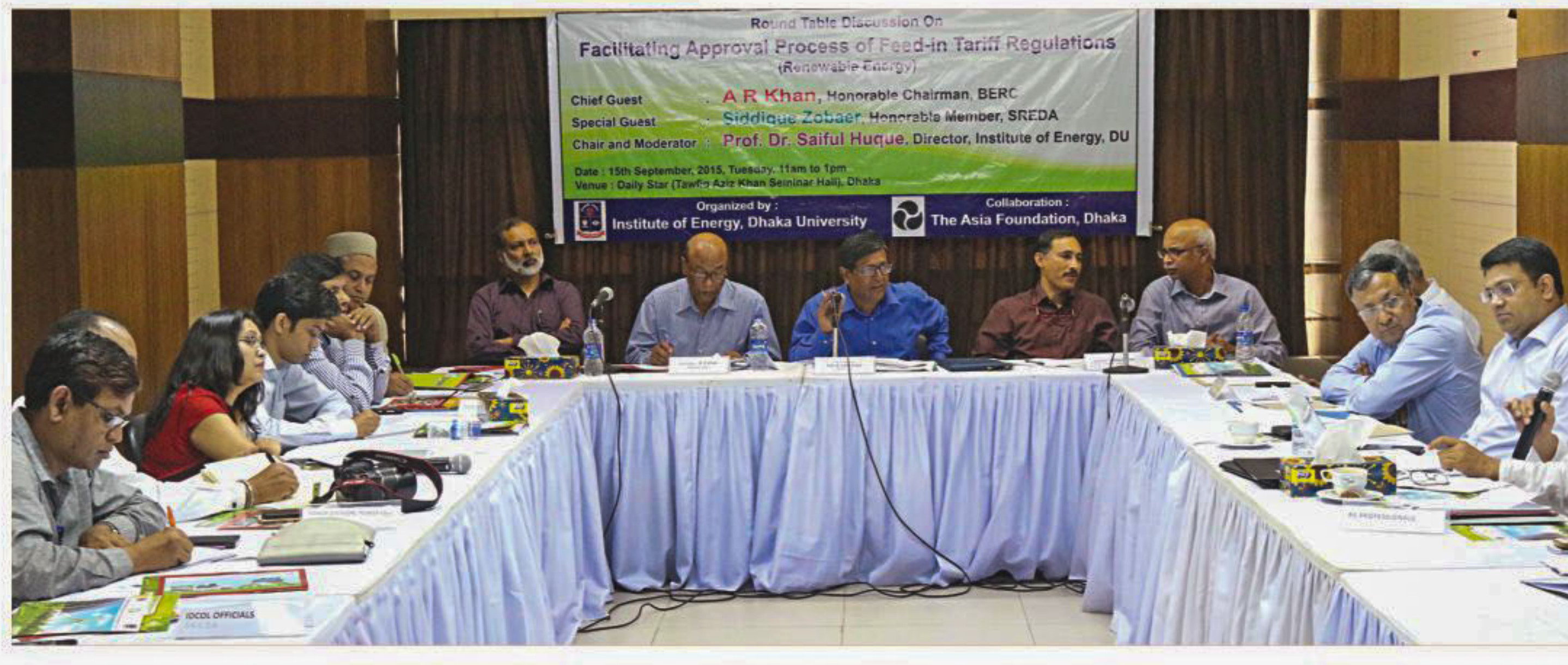
Regulators, academics and government officials attend a seminar on feed-in tariff regulations for renewable energy at The Daily Star Centre yesterday. The Institute of Energy of Dhaka University in collaboration with the Asia Foundation Dhaka organised the event.

Analysts say at seminar at The Daily Star Centre