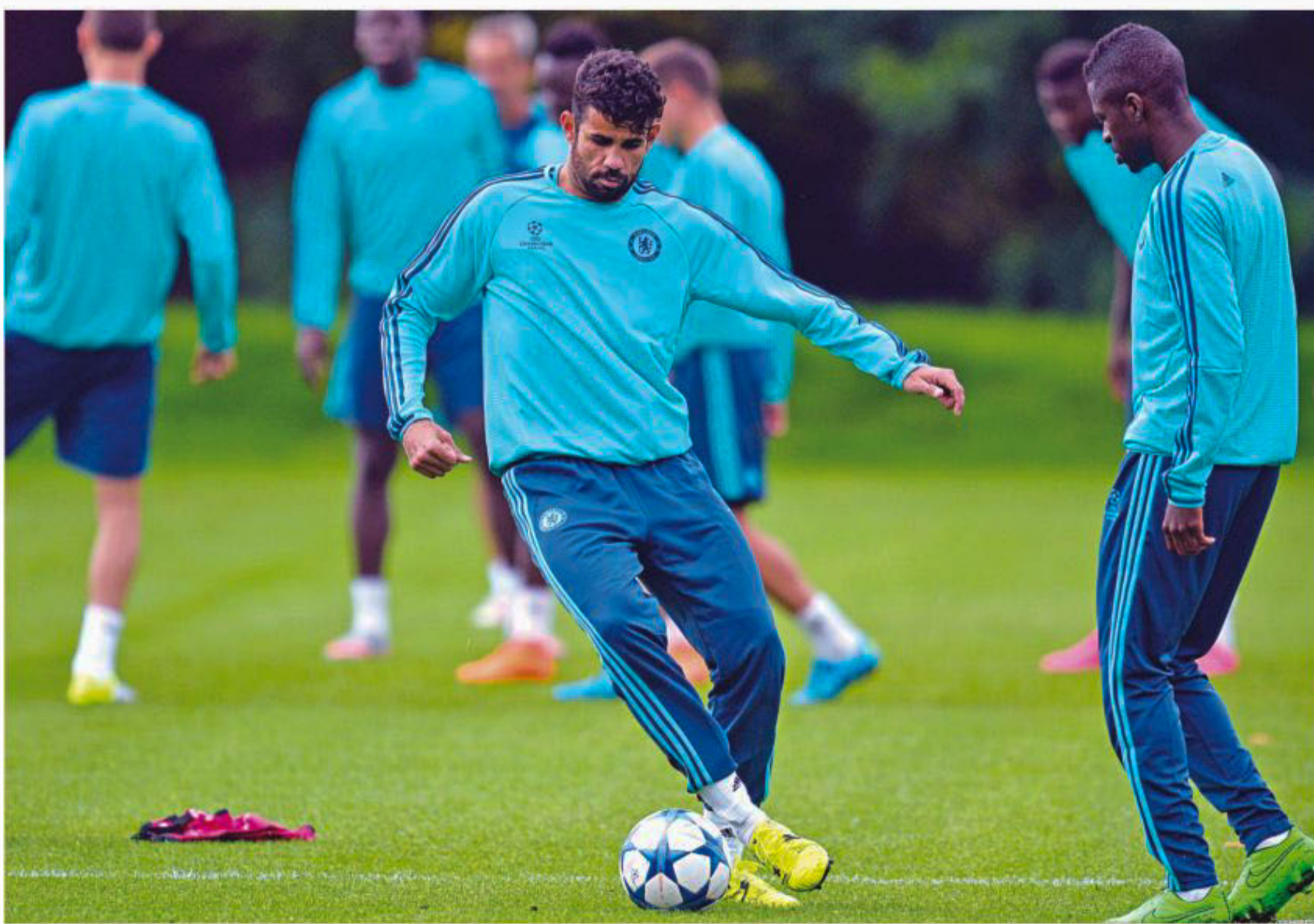
Chelsea striker Diego Costa (C) moves the ball during a training session in Stoke D'Abernon yesterday ahead of their Champions League Group G match against Maccabi Tel Aviv.

Hein Vanhaezebrouck's Ghent are perhaps unique in the Champions League as they would have preferred a tougher group. Denied the chance to take on a Barcelona, Bayern Munich or Manchester United, their debut in the competition sees them tackle it with limited ambitions. Lyon, semifinalists in 2010, will be expecting to take three points to boost their chances of a place in the knock-out rounds, although they are missing injured forward Nabil Fekir.