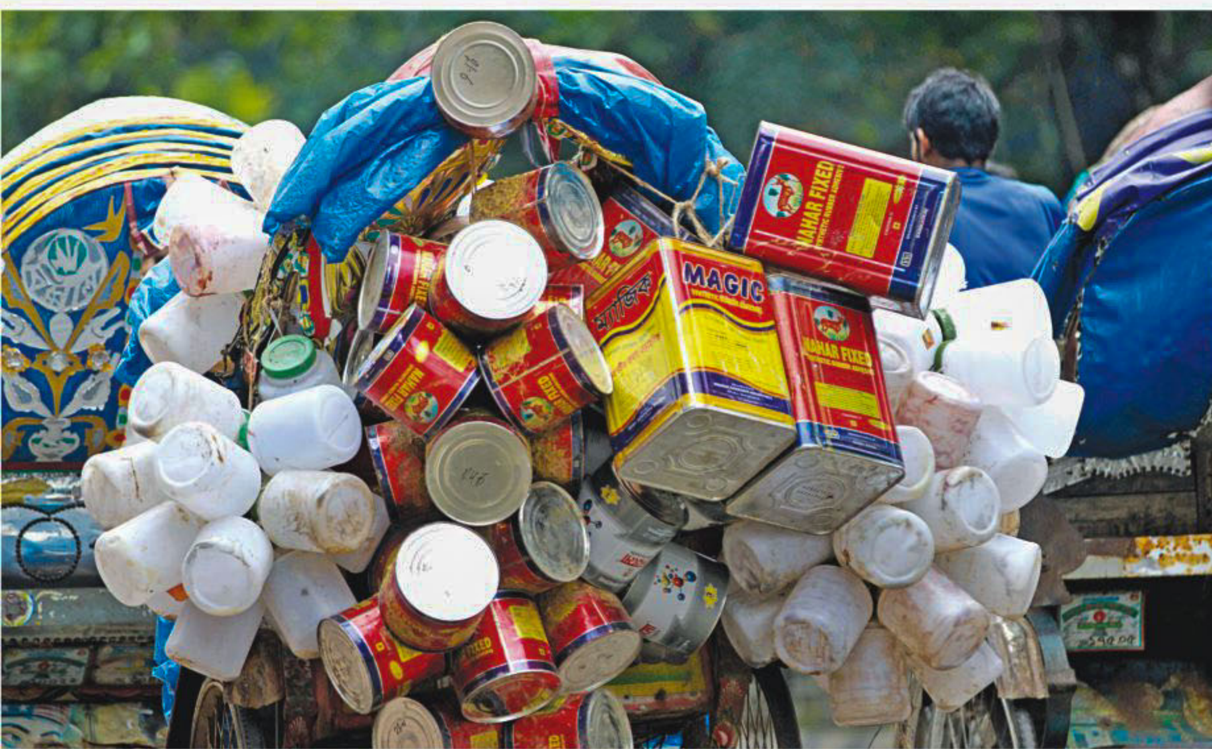
A rickshaw overloaded with empty plastic and tin cans plies in close proximity to other rickshaws on a busy road in the capital's Mirpur area, running the risk of accident anytime. The photo was taken recently.

STAFF CORRESPONDENT The government yesterday gave final clearance for declaring Mymensingh as the country's eighth administrative division. The decision came at a meeting of the National Implementation Committee for Administrative Reforms (Nicar), with Prime Minister Sheikh Hasina in the chair. Earlier on January 26, the cabinet approved a proposal to set up the new division which will consist of four districts -- Mymensingh, Jamalpur, Sherpur and Netrakona. Tangail and Kishoreganj, two other districts of greater Mymensingh, were SEE PAGE 11 COL 5