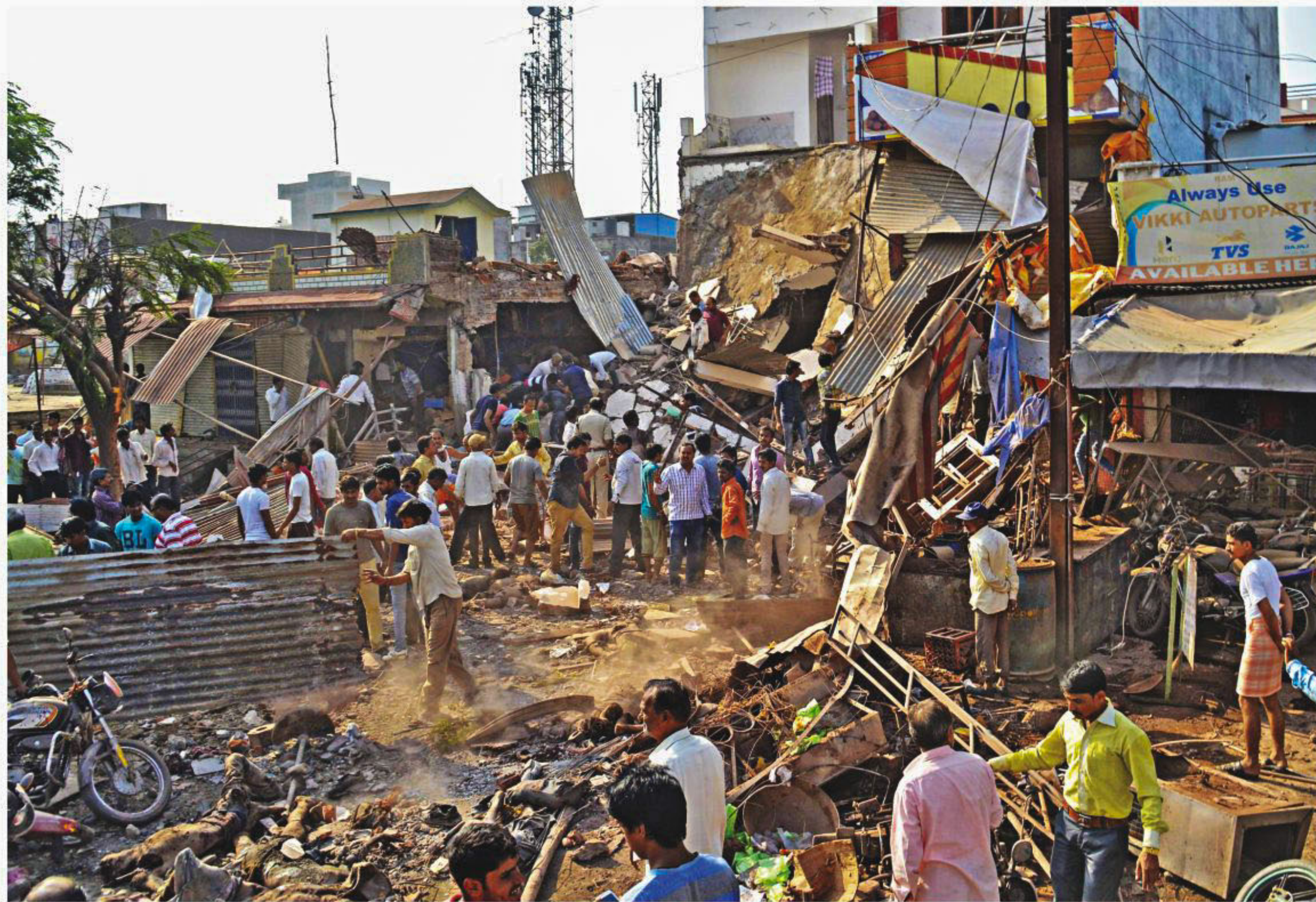
People gather around the site of an explosion in Jhabua district in the central Indian state of Madhya Pradesh yesterday. At least 90 people were killed and dozens injured when a gas cylinder exploded in a restaurant there.