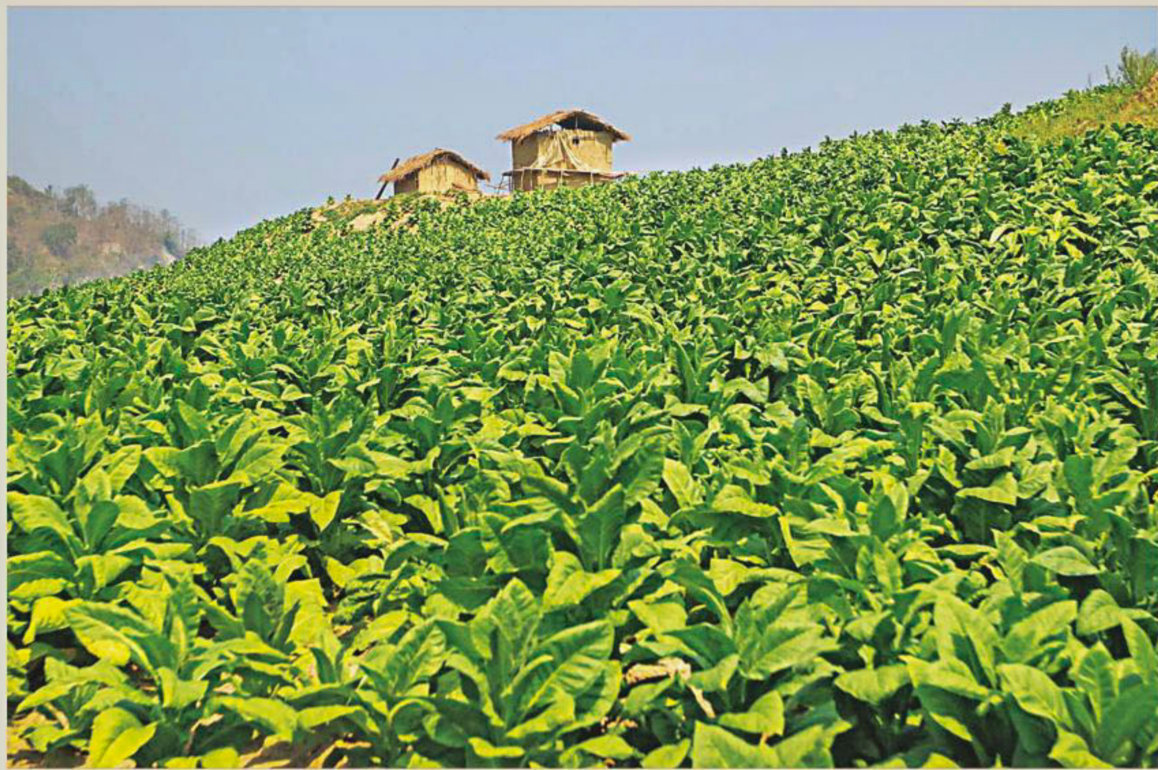
A tobacco plantation in Bandarban's Thanchi. Farmers in the hill district are increasingly switching to tobacco cultivation for higher returns.