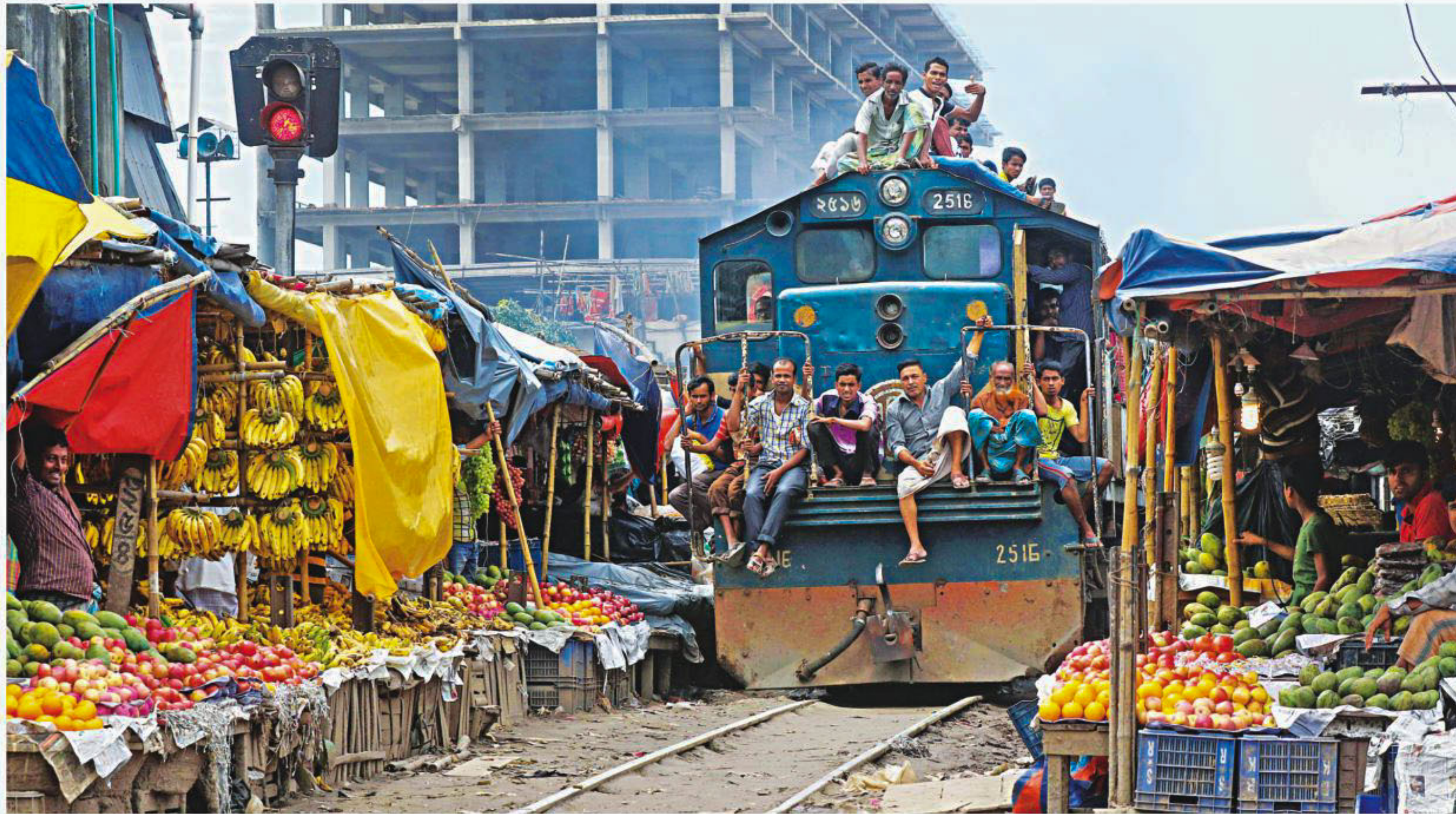
A train moves along the Dhaka-Narayanganj rail tracks that run through Jurain Bazar with shops in dangerous proximity. Apart from a risk of collision anytime, there remains another danger here as some people are casually travelling on the train roof and at the front of the engine. The rail lines also look anything but useable. The photo was taken recently.

He claimed his party was rather working for restoration of the Generalised System of Preferences facilities in the US market.