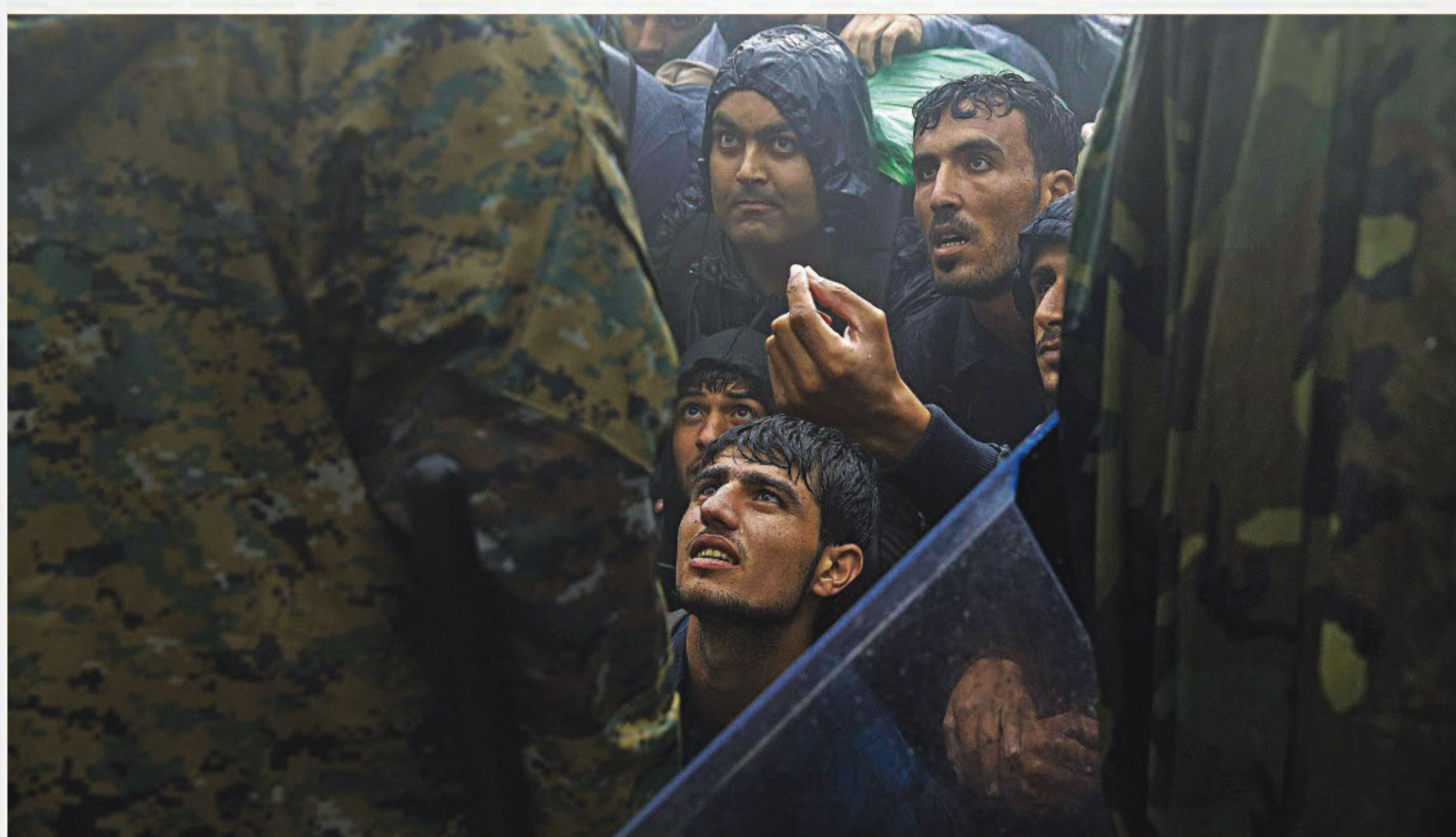
Migrants and refugees beg Macedonian soldiers to allow them passage through the Greece border into Macedonia during a rainstorm near the Greek village of Idomeni yesterday.

PANKAG KARMAKAR The government yesterday hiked bus and CNG-run auto-rickshaw fares in Dhaka and Chittagong cities amid passengers' worry that transport operators may charge them more than the rate fixed. Passengers alleged they had to pay more than the government-set rates every time transport fares were increased in the past, thanks to lax monitoring by the authorities concerned. The bus fare will go up around 7 percent this time to Tk 1.70 per kilometre from Tk 1.60. The fare for minibuses will become Tk 1.60 from Tk 1.50 per kilometre. However, the minimum bus fare remains Tk 7. It is Tk 5 for minibuses. While announcing the new rate at the secretariat yesterday, Road Transport and Bridges Minister Obaidul Quader expressed his unhappiness with transport operators and said they often do not follow the government-set rates. He, however, said an 11-member committee, headed by a Bangladesh Road Transport Authority (BRTA) director, has been formed to strictly monitor the situation. SEE PAGE 17 COL 4