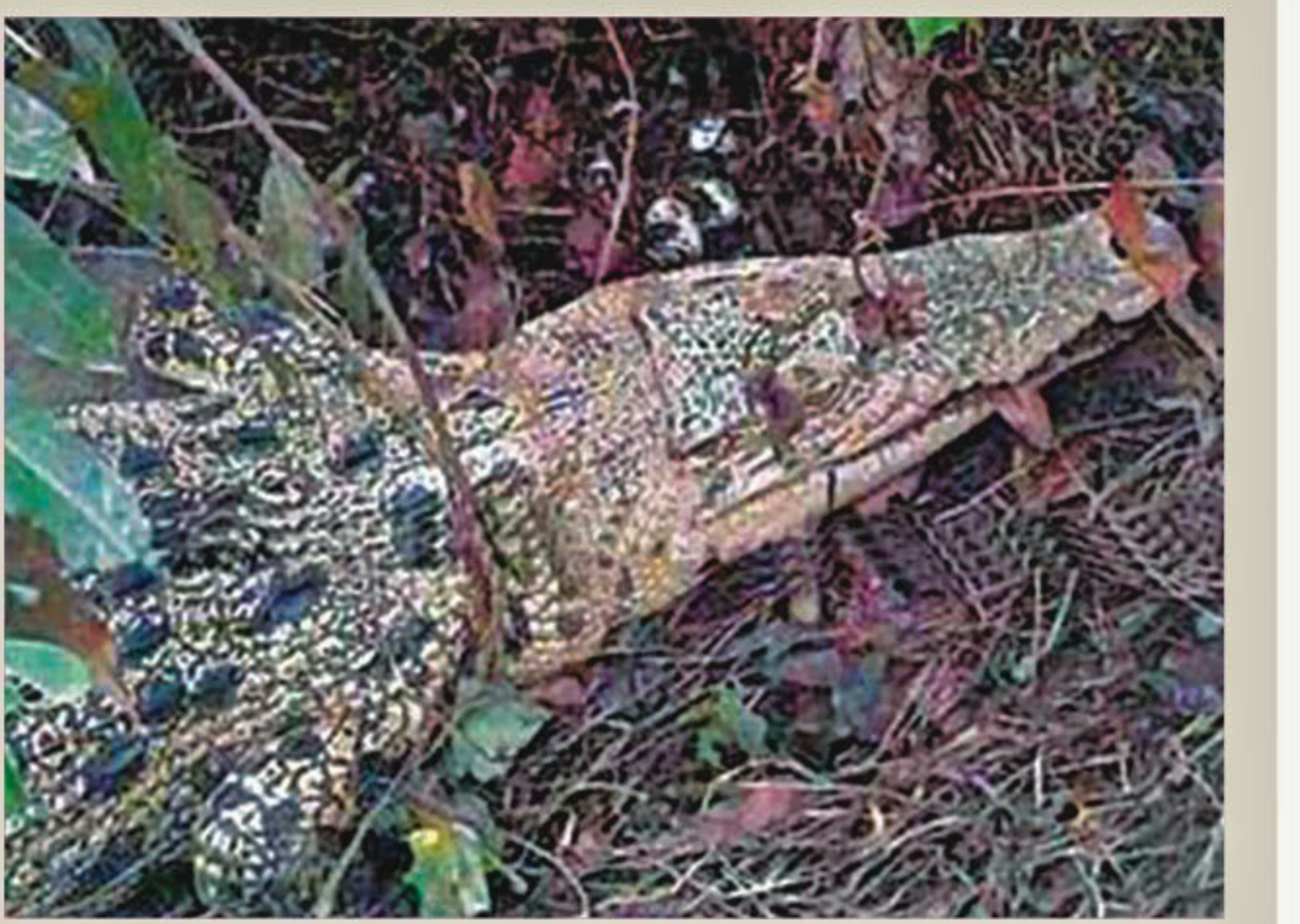
Crocodile Sakhina is seen with her eggs in the photo taken at Tengrariri Reserve Forest in Barguna's Taltali upazila about two weeks ago.