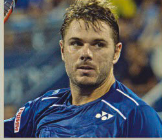
STAN WAWRINKA Age: 30 Titles: 10 (including two Grand Slams) Best US Open: Semifinals (2013, 2015)