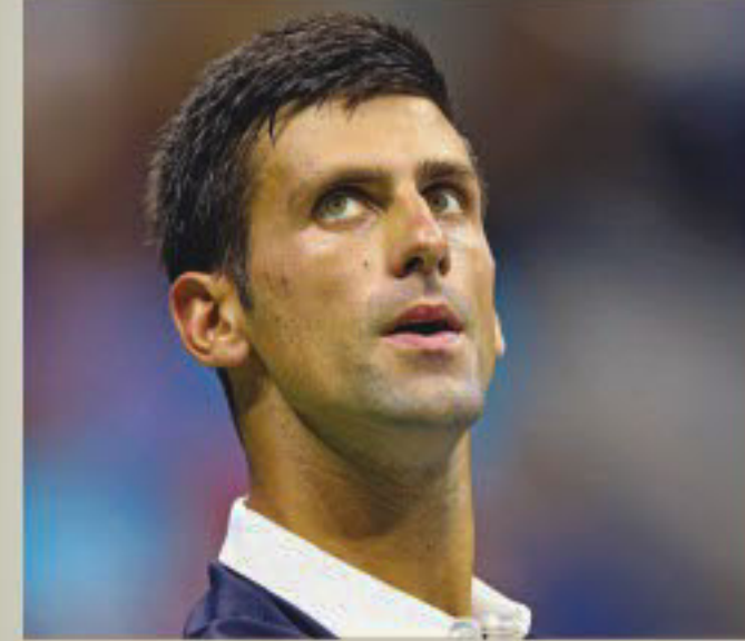
NOVAK DJOKOVIC Age: 28 Titles: 54 (including nine Grand Slams) Best US Open: Champion 2011

Djokovic (SRB x1) v Cilic (CRO x9) (Djokovic leads head-to-head 13-0)