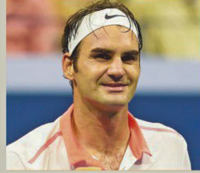
ROGER FEDERER Age: 34 Titles: 87 (including 17 Grand Slams) Best US Open: Champion (2004, 2005, 2006, 2007, 2008)

Federer (SUI x2) v Wawrinka (SUI x5) (Federer leads head-to-head 16-3)