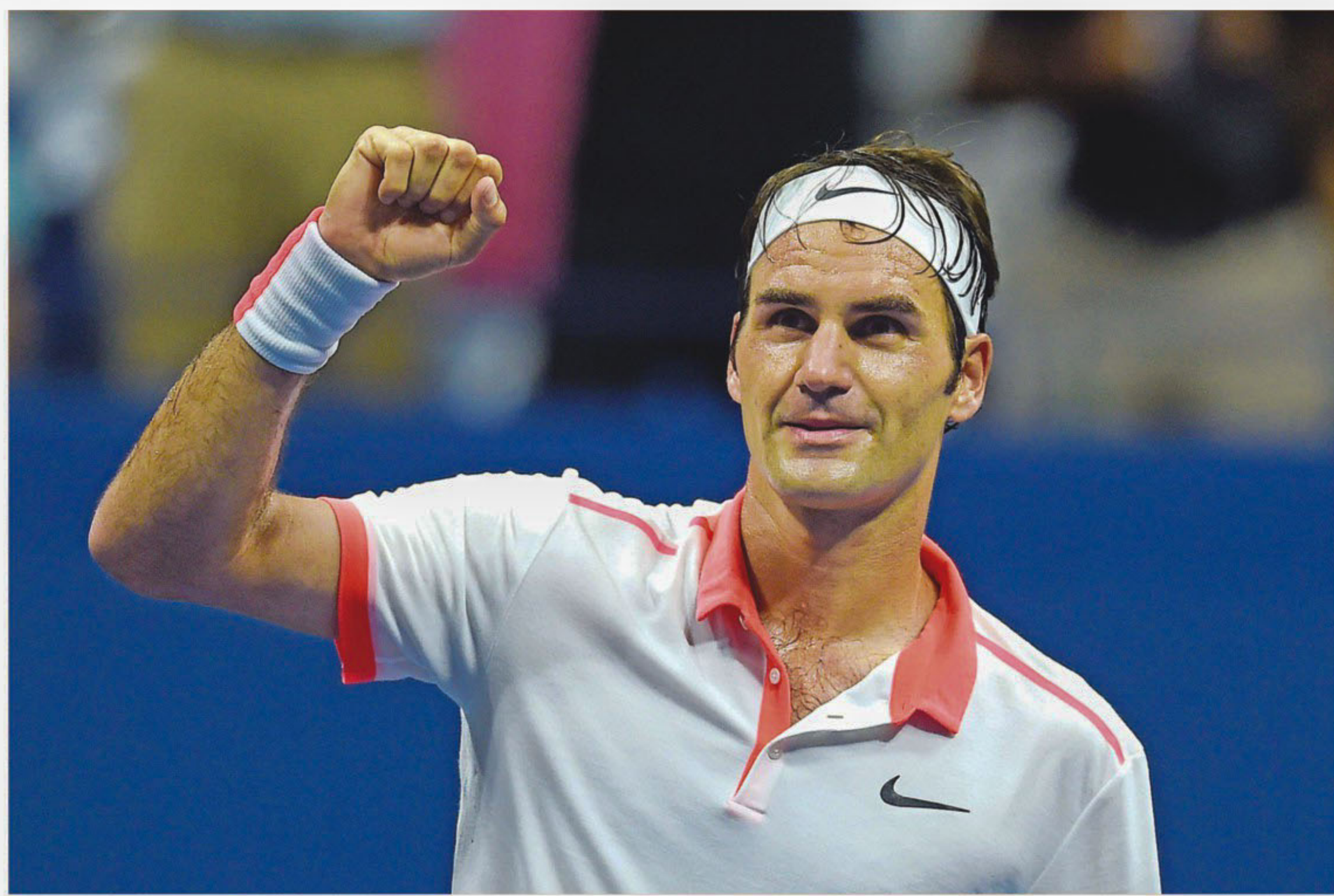
Roger Federer of Switzerland celebrates after defeating Richard Gasquet of France during their US Open men's singles quarterfinal at Flushing Meadows in New York on Wednesday.

"But in any case we will continue to work hard, we need to score points, to catch up with those ahead of us, to try to perform successfully in the Champions League."