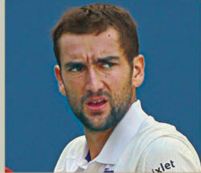
MARIN CILIC Age: 26 Titles: 13 (including one Grand Slam) Best US Open: Champion 2014

Federer (SUI x2) v Wawrinka (SUI x5) (Federer leads head-to-head 16-3)