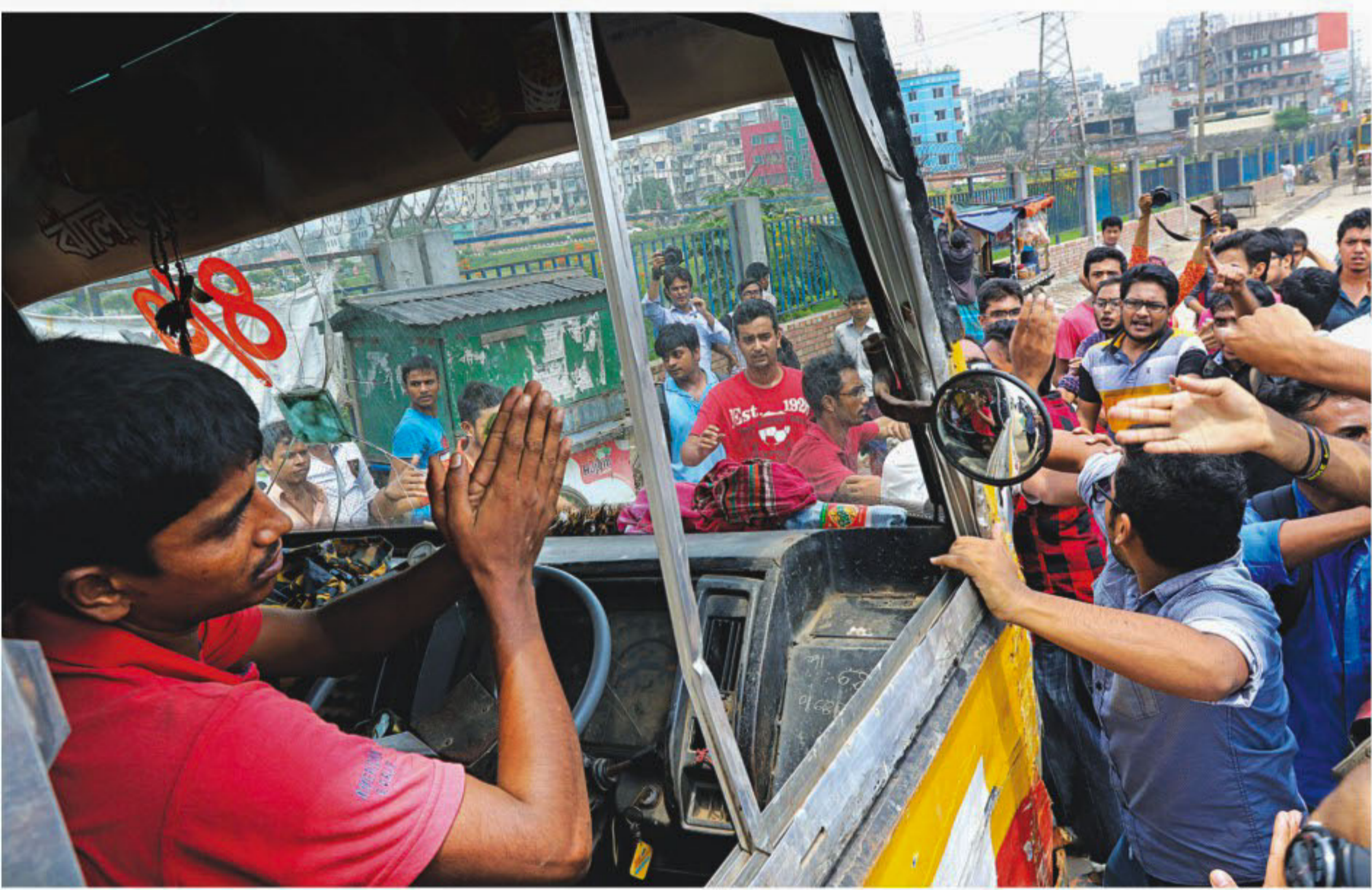
Students of East West University stop a bus on the Rampura-Badda road near Aftabnagar. As on Wednesday, they blocked the road for hours yesterday as well, protesting a 7.5 percent VAT on 'tuition fees' at private universities.

Meanwhile, left-leaning student body Bangladesh Chhatra Federation in a press release yesterday expressed solidarity