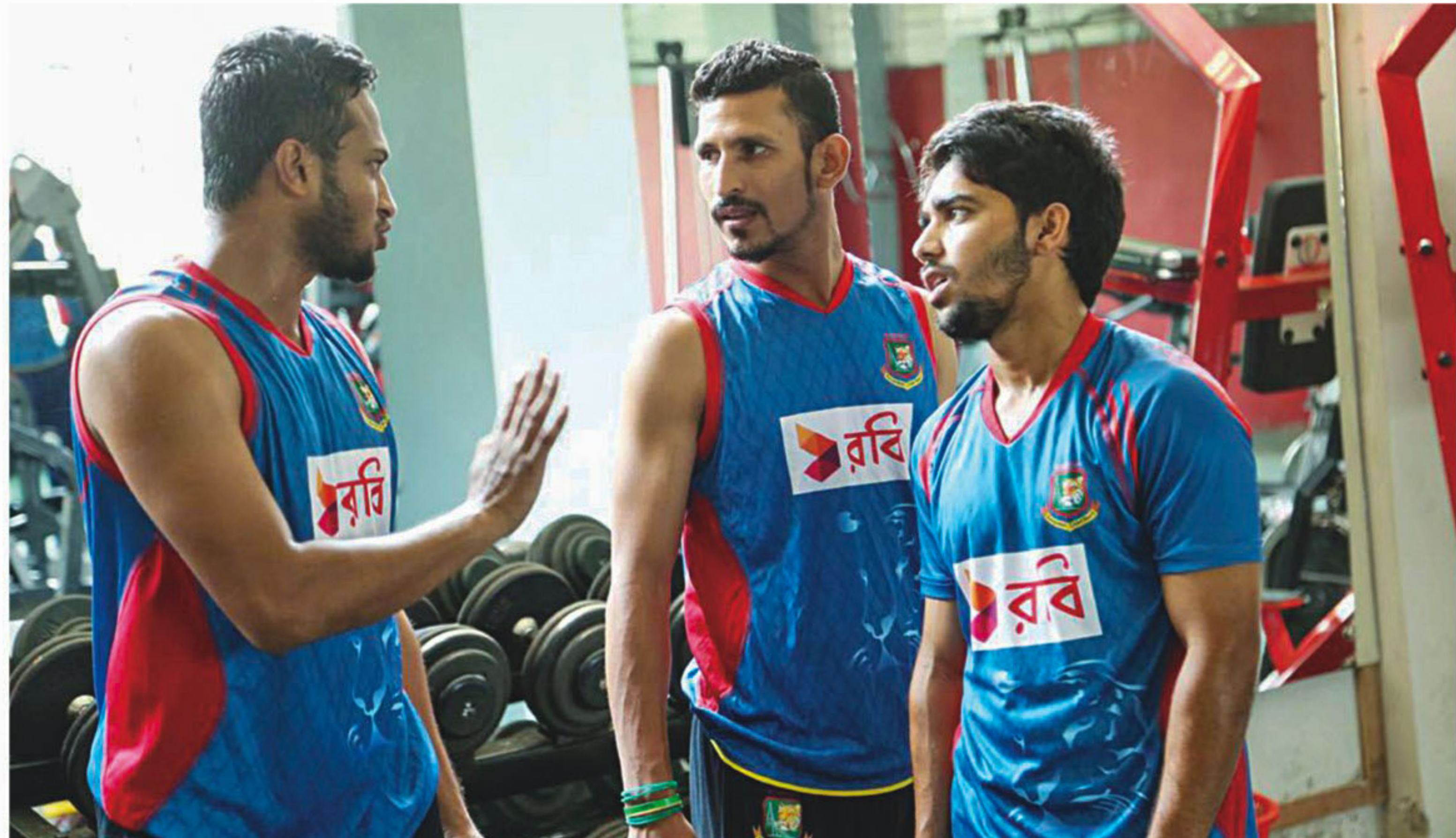
JUST RELAX: Ace all-rounder Shakib Al Hasan (L), who knows India's cricketing conditions like the back of his hand, seems to be sharing his wisdom with Bangladesh A skipper Mominul Haque (R) and vice-captain Nasir Hossain ahead of their tour to Bangalore.