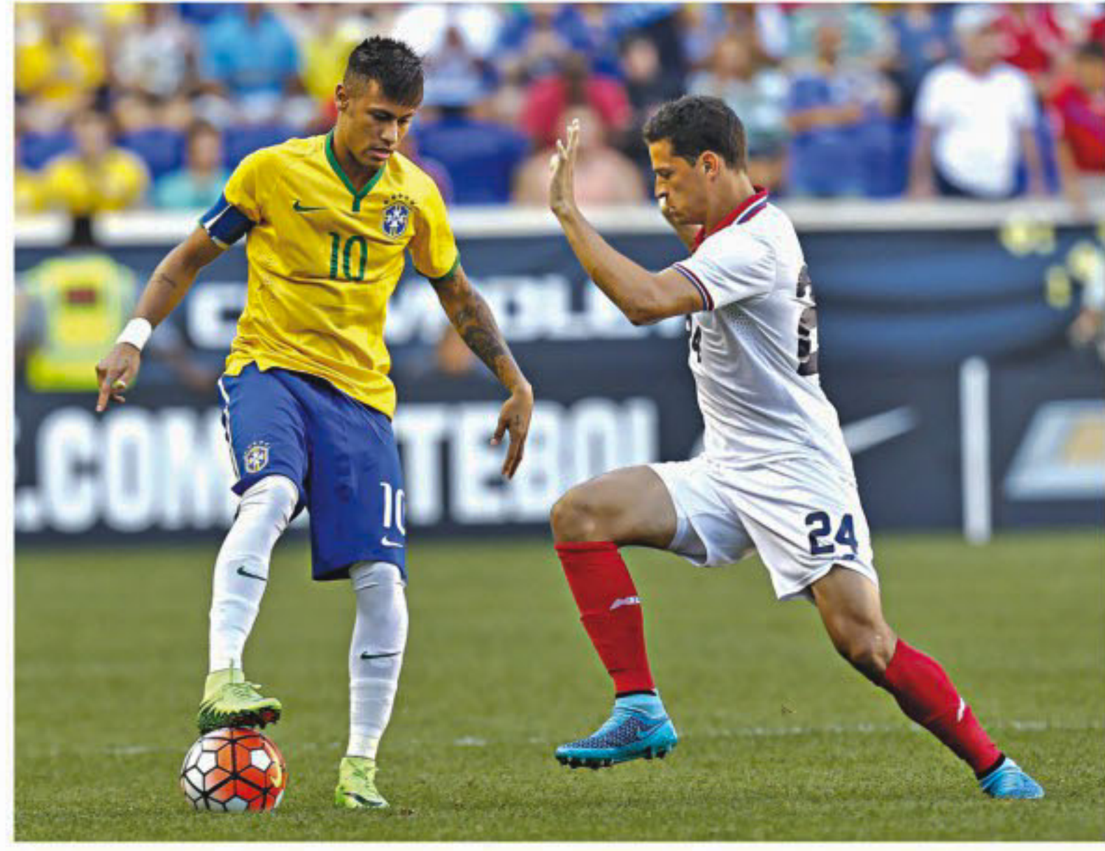
The fans at the Gillette Stadium got their money's worth as Neymar dazzled them for 45 minutes and scored twice in typically stylish fashion during a 4-1 win against USA.