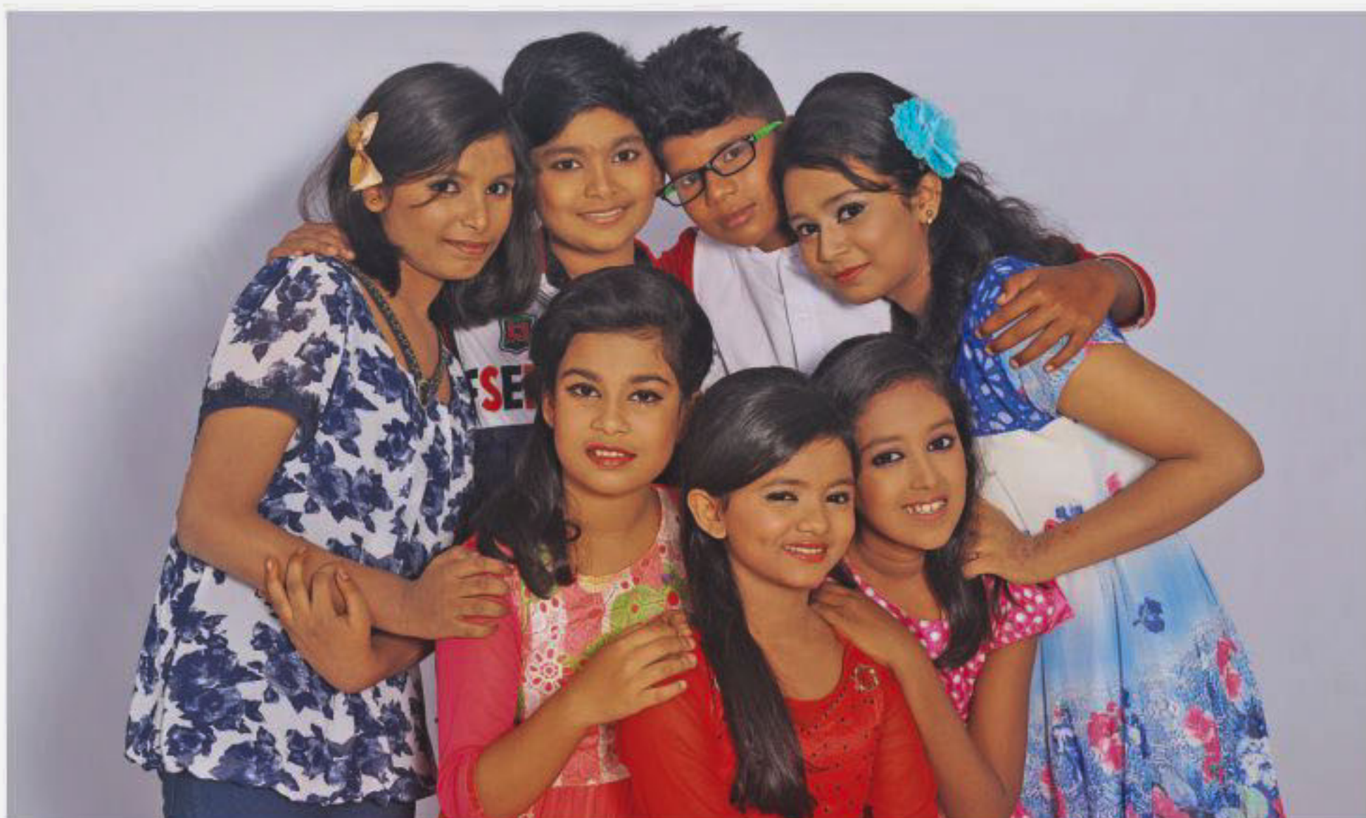
Top seven contestants of Khude Gaanraj pose for a photo.