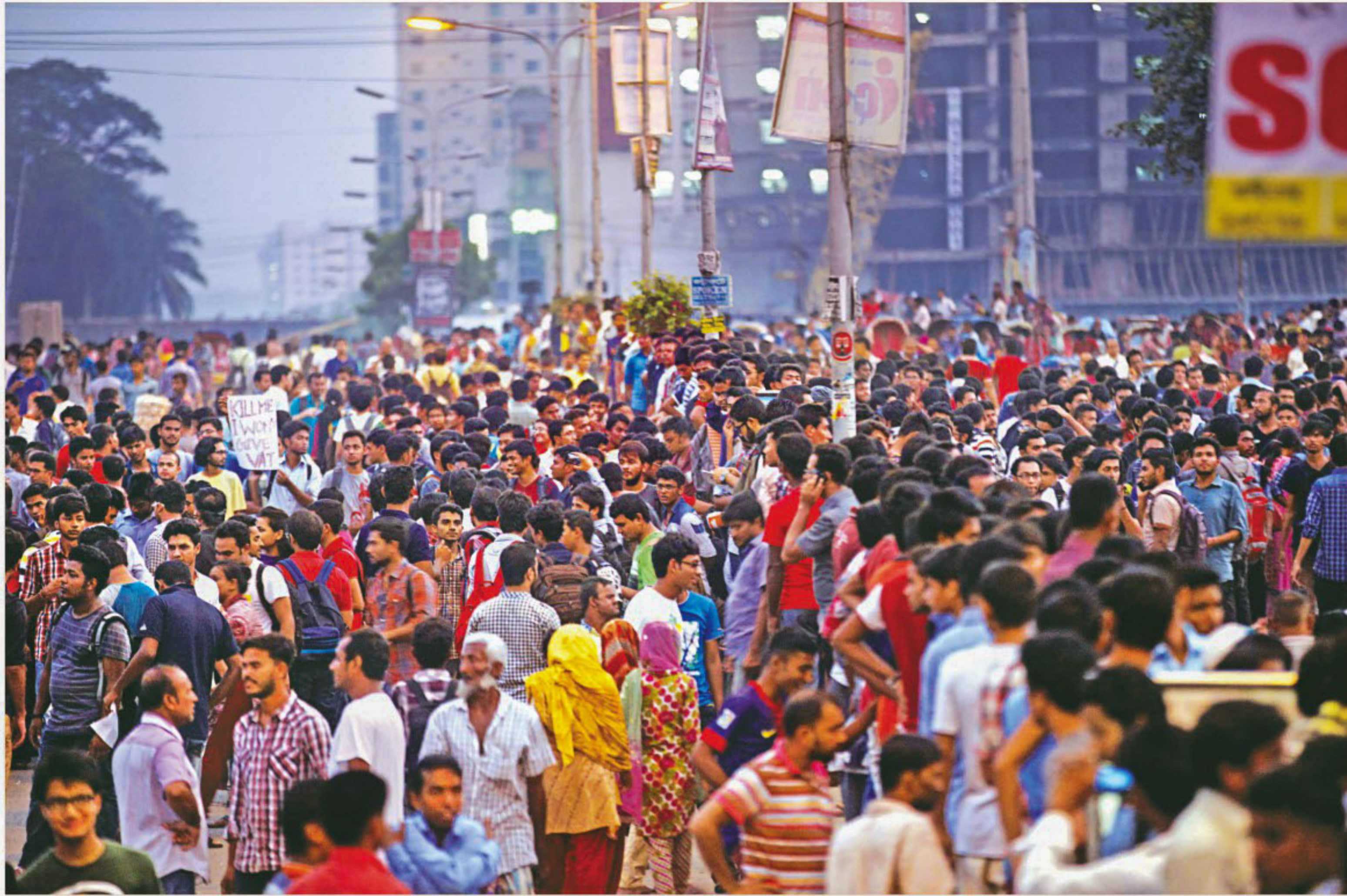
Students of East West University blocking Badda-Rampura road in the capital yesterday, protesting the VAT slapped on private university tuition fees. Later, dozens were injured, some with rubber bullets, in a clash between them and police.