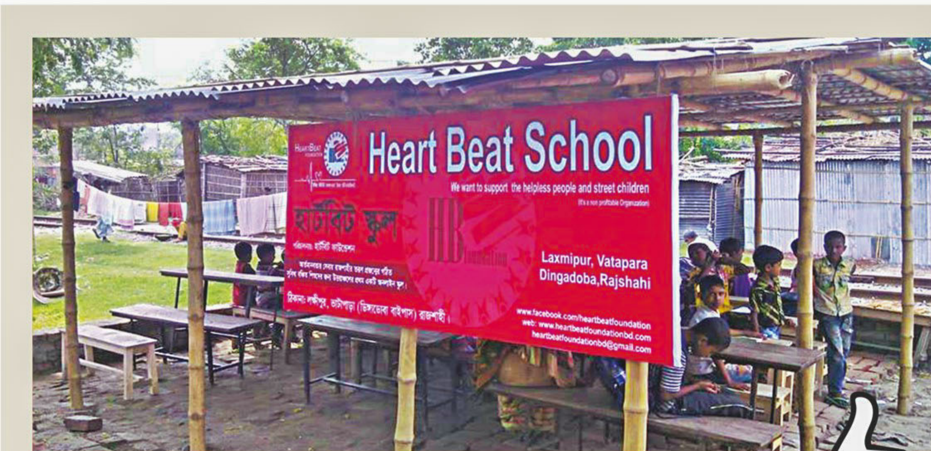
With no walls or electricity, this shed serves as the classroom of Heart Beat School at Laxmipur of Rajshahi. Saving their pocket money, 24 university and medical college students run this school for street children.