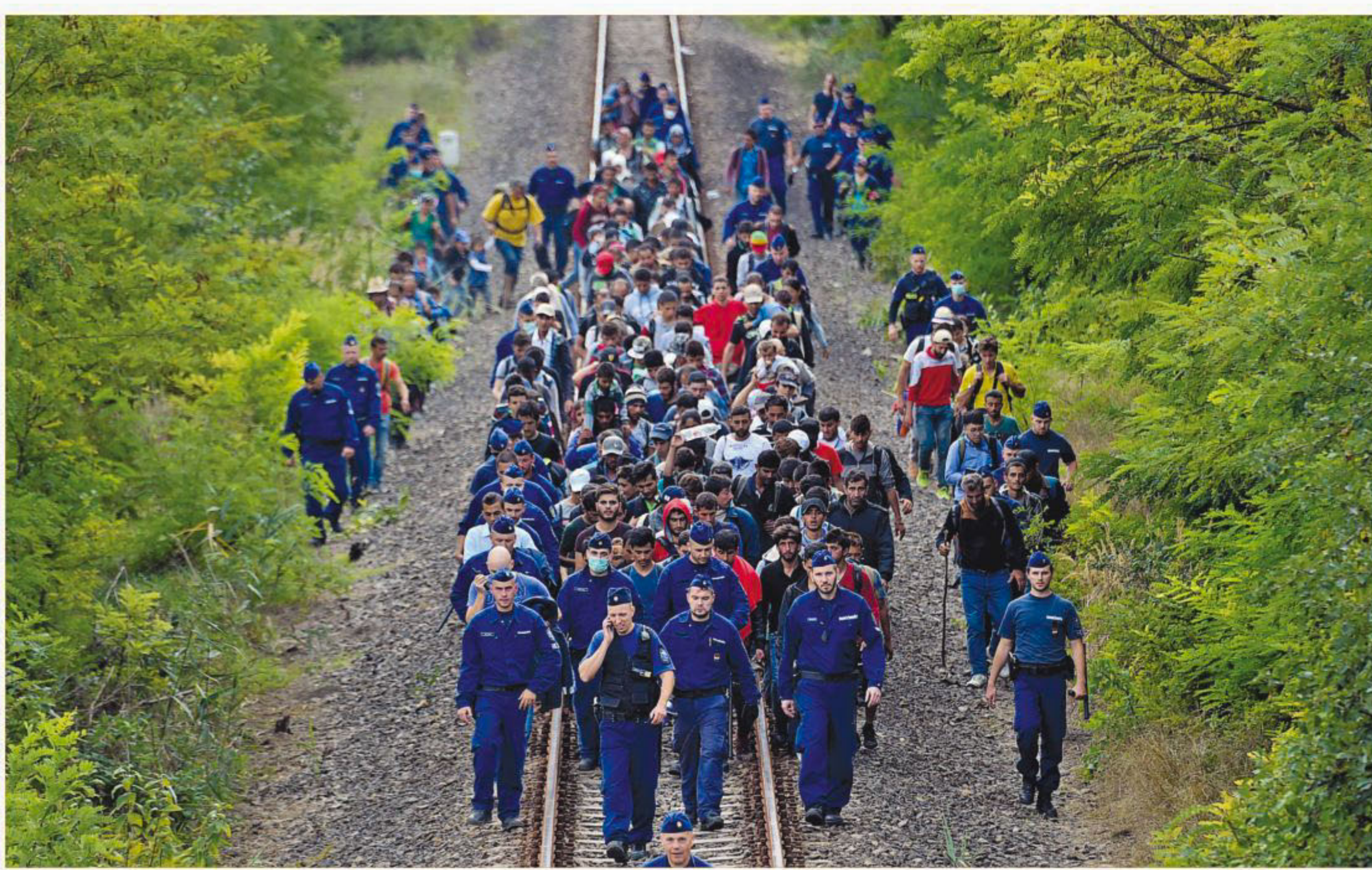
Refugees of different countries accompanied by police officers walk on the railway tracks near Szeged town as they broke out from the migrant collection point near Roszke village of the Hungarian-Serbian border; A young refugee attends his mother, as the elderly woman passed out after a cold night at a migrant collection point near Roszke; and a migrant carrying a baby is stopped by a Hungarian policeman as he tries to escape a collection point.

Fighting in eastern Ukraine has fallen to its lowest level since the conflict started, Ukrainian Defence Minister Stepan Poltorak said. Poltorak said Ukrainian forces were coming under attack just two to four times a day - the lowest rate in the past year and a half. The reduction in violence comes a week after the latest ceasefire agreement came into force on 1 September.